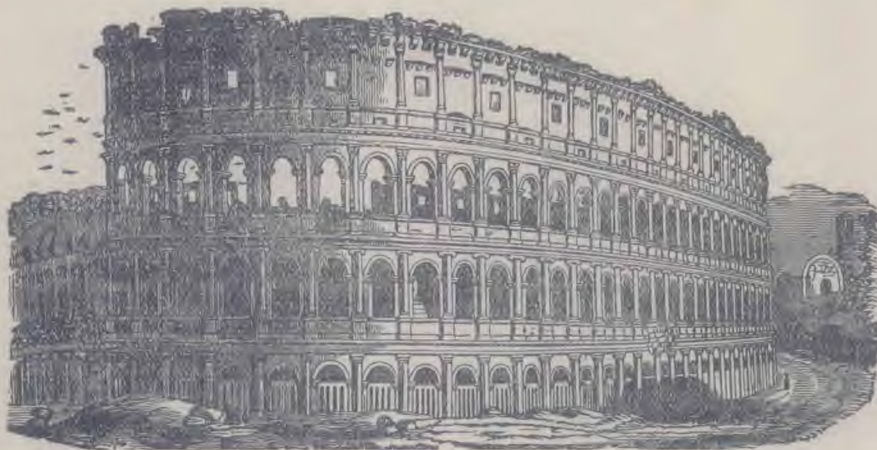
THE COLISEUM AT ROME, THE SCENE OF MANY MARTYRDOMS.

The Church of Christ can never be engaged in agitation against any political power on earth, to say nothing of joining revolutionary movements. Christians are ambassadors of a kingdom "not of this world," and an ambassador does not meddle in the political affairs of the country to which he is accredited. Of course, Romanists would say that the Italian Government is wicked, and ought to be overthrown. But when the Lord told the Church at Rome to be subject to the constituted power, Nero