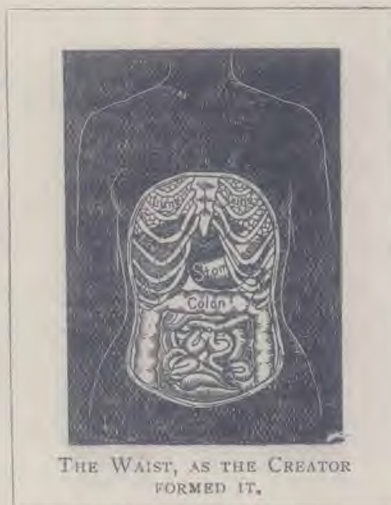
THE WAIST, AS THE CREATOR FORMED IT.

Such is the influence of custom and tradition, that women, even in these days, are