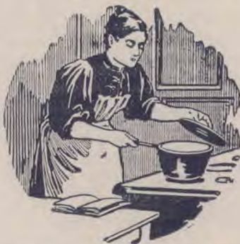
2nd Edition—20th Thousand, sold within one year by our Australian houses.