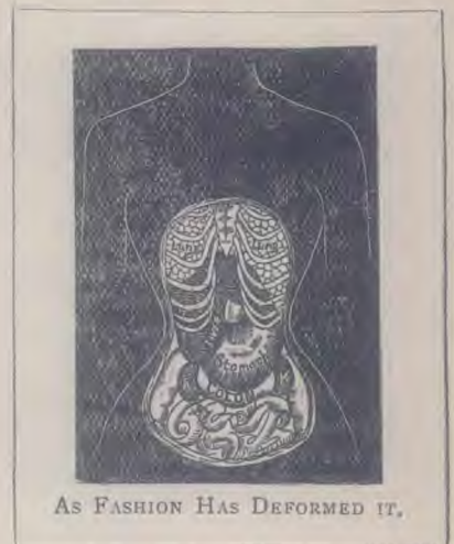
AS FASHION HAS DEFORMED IT.

What is the body for? Is it designed for decoration, or for use? It is an aboriginal idea that the body was meant for ornamentation. The savages tattooed their bodies before they invented clothes. It is a Christian and humanitarian principle that the body was intended to serve man's mind and soul. It is reasonable to suppose that the Creator knew how to make the body so that it could best serve