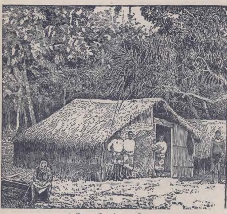
A SOUTH-SEA ISLAND SCENE.

Thus equipped, I began once more sinking away at the well, but at so wide an angle that the sides might not again fall in. Not a native, however, would enter that hole, and I had to pick and dig away till I was utterly exhausted. But a teacher, in whom I had confidence, took charge above,