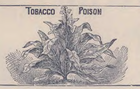
INFORMATION FOR SMOKERS.

If space allowed, I might show that temperance pertains to eating as well as to drinking. Alcohol that is produced within the body is just as poisonous as that which is produced in a still, and then swallowed.—South African Sentinel.