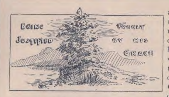
VICTORY IN THE LORD. Imperfection and Ruin by Transgression.