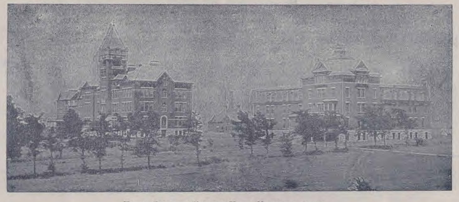
UNION COLLEGE, COLLEGE-VIEW, NEBRASKA, U.S.A.

This college was founded in 1891 for the purpose of training young men and women for Missionary work. The founders of this institution had a firm belief in the near coming of Christ and it was their object to establish an institution where young men and women might receive a preparation which would enable them to carry the good news of the Coming of Christ to various parts of the world. Since its opening to the present time, the school has enjoyed a good patronage and there are to-day scores of young men and women in various parts of the world who received a Bible education within its walls and are doing what they can to present the Present Truth in many lands. This with its colleagues in America, England, Australia, South Africa, and even the Islands of the sea, is doing yeoman service in training young people to give the special gospel call—Christ's Second Coming.