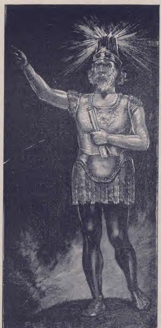
The Light that lighteth every man.

But how much does this idea of God differ from that which is set forth by the new theology, which is now being so widely accepted? Note the following utterance by one of the leading exponents of this scientific religion: "The aspect of prayer is changing. The New Experience does not look out and up to