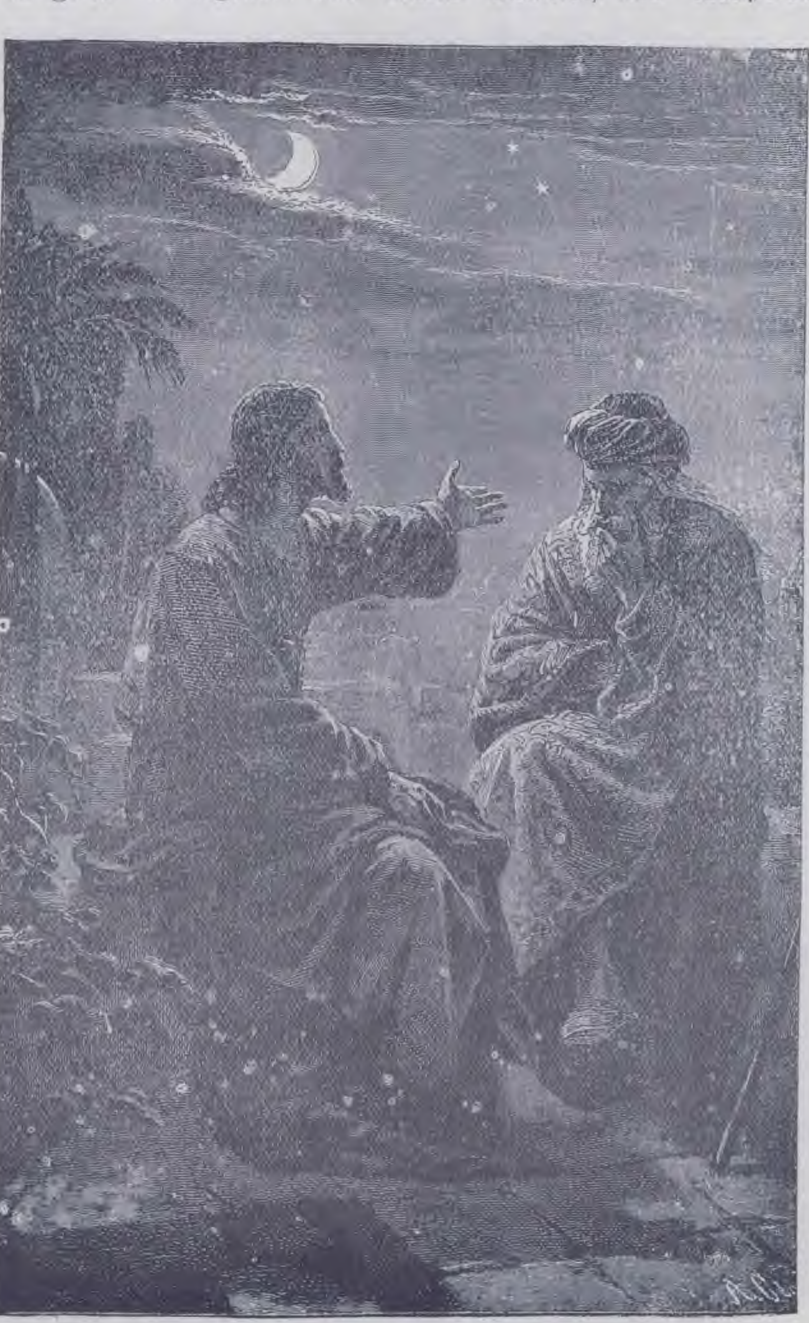
Except a man be born again he cannot see the kingdom of God.

The Lord Jesus acts through the Holy Spirit : for it is his representative. Through it he infuses spiritual life into the soul, quickening its energies for good, cleansing from moral defilement, and giving it a fitness for his kingdom. Jesus has large blessings to bestow, rich gifts to distribute among men. He is the