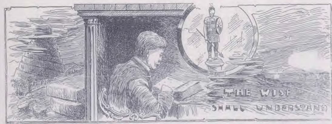
THE GREAT IMAGE OF DANIEL TWO.

An image of gigantic form was shown to Nebuchadnezzar in a dream. Its head was of gold, breast and arms of silver sides of brass, legs of iron, feet and toes part of iron and part of clay. Beginning with the most precious metal, there is a uniform descent till it ends with the basest. Finally a stone cut out of the mountain without hands smote the image upon the feet, dashed it to atoms, the wind carried away the fragments like chaff, and the stone became a great mountain and filled the whole earth.