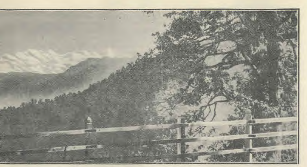
A Himalaya snow scene-a glimpse of the sublime, awe-inspiring Arandeur of God's creation.