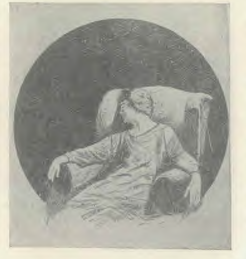
These nervous conditions-in numerous casesmay be avoided

moulding our lives. A housewife who has the duties of home devolving upon her goes through much the same routine day after day, and, if this monotony is not broken by some form of change from time to time, her vision becomes cramped and limited and her nerves overstrung and super-sensitive. Things which would pass unnoticed by a man who is out in the world all day, appear as terrible catastrophes to the woman confined in the home. Soon she begins to harp on her troubles and difficulties, and before she is aware the habit of worrying is established.