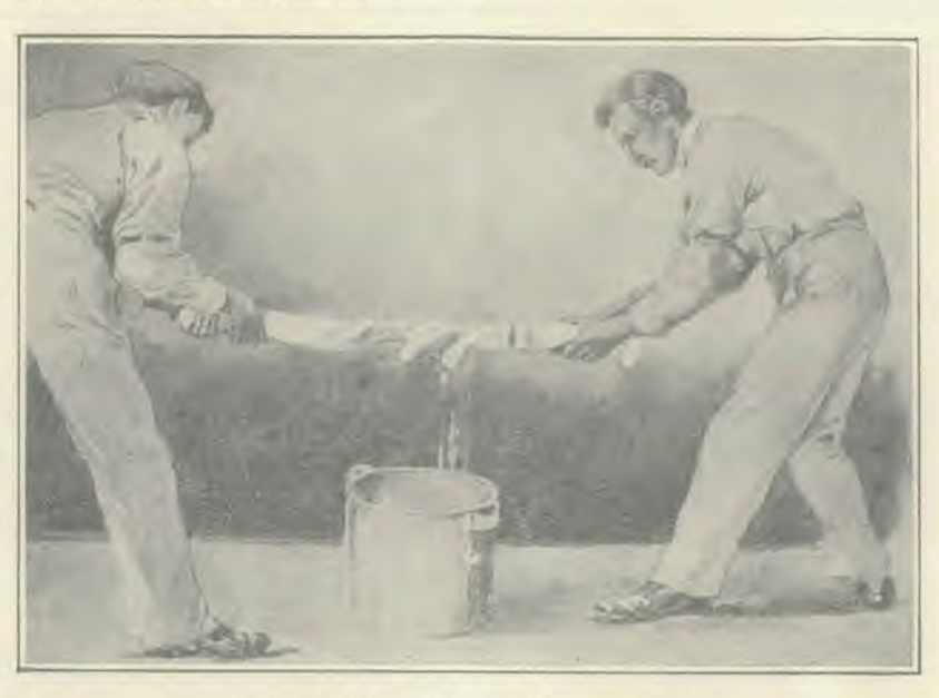
Correct Method of Wringing a Fomentation Cloth

After the cold day is over, the ashes in the grate are an indication of the fuel that has been burnt. Similarly after a man's work has been faithfully accomplished, the resulting waste products circulate in his blood, and these waste products numb the brain, lessen its circulation, and induce sleep. During sleep no food is eaten, no muscles are exercised, and the waste products are gradually excreted through the kidneys, skin, and lungs, and the man should rise in the morning fresh and wide awake—refreshed and wide awake because the benumbing waste products have been removed.