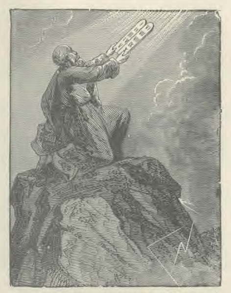
Moses was a trained leader in a critical age and one of the most remarkable characters of history

tory of that people. The teachings and experiences of the fathers, and their own experiences in Egypt, were but a preparation for this. And in their desert wandering, as in all their subsequent history, whenever they needed to be reminded of their high calling, they were reminded of Sinai. Here the Jews were given a code of civil and judicial law that gave them a political entity as a theocracy, a God-kingdom. Here were laid down the foundation principles of all free government: that law must be accepted and supported, not by force, but by the conscience of the people themselves, and that reverence for God and recognition of His supreme authority is the very essence of good citizenship. And it was here that they were told that if they would be true to Jehovah He would be their God. Since a great enlightenment always carries with it (Turn to page 28)