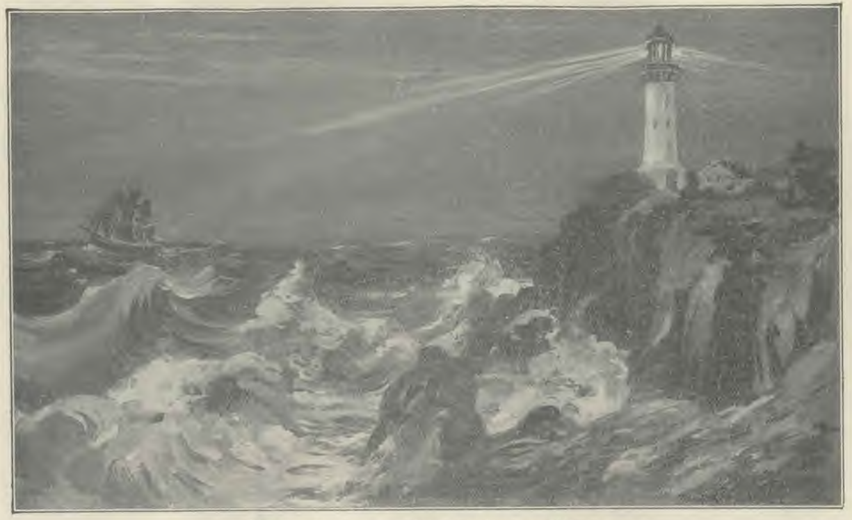
Divine prophecy serves as a light to mariners upon life's seas

ROPHETS of God, living before the time of Christ, were divinely informed concerning the life of Him who should come as the Divine Saviour of the world. This being the case surely from their description we can tell whether the conditions outlined beforehand were fulfilled in the life of Jesus. We will look through writings written, many of them, hundreds of years before the birth of Jesus; and the prophecies we shall consider will be of a specific, not a general, character. They will not be like the Delphic oracle which, at one time when inquired of by a certain king as to whether his expedition against another empire would be successful or not, gave the verdict: "Go forth, and a great empire will be destroyed." The king gave battle but was himself conquered. However, the priests of the oracle claimed that the prophecy had been correct-for had not a great empire been destroyed? The oracle had not designated which empire would be destroyed and so would have been right in either case. Such are not the writings of the prophets of the Bible from which we quote now,