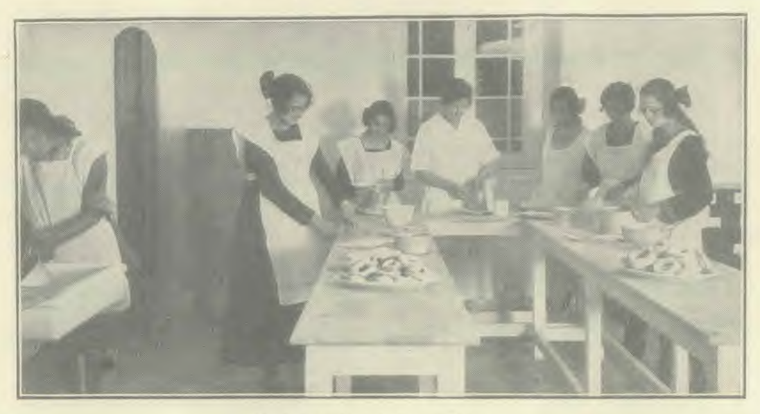
Our Birls should study Domestic Science

GREAT interest in the science of food and food preparation has been stimulated by the introduction of the name "dietitian," and young women are taking a full college course in schools of dietetics. This is good. The terms "dietitian" and "dietetics" have given a dignity to the profession that is not carried by the words "cook" and "cooking." Of course the dietitians will say that a dietitian is far more than a cook and dietetics includes much more than cooking, which is true. It would certainly be safer for those who must do the eating if all cooks were dietitians. However, many dietitians who have taken their courses in some school of domestic science, while they have acquired a valuable fund of scientific and theoretical knowledge about food and how it should be prepared, have had a ridiculously small amount of actual experience in the preparation of food, some having cooked as much as half a potato, for example, so I have read, during their course; but we learn by doing. The more practical experience in the handling and preparation of food that can be put into courses in domestic science and dietetics, the greater will be the skill, ability, and proficiency of the graduates of the school.