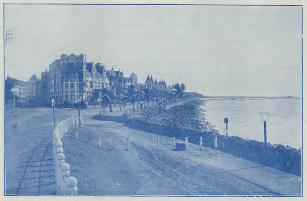
G. I. P. Railway Publicity Bureau.