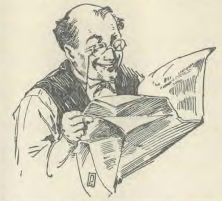
Baldness is, in many cases, the result of ignorance and neglect of scalp hygiene

druff will have no chance to accumulate. The shampoo twice a month and the daily brushing as described will usually do away with the trouble. If excessive and obstinate, however, shampoo the hair once a week with six or eight eggs and plenty of hot water. Rinse well, dry the scalp quickly and follow with a vigorous massage with the finger tips. A simple and effective tonic is made of one pint of bay rum, one pint of soft water, and a teaspoonful of salt. Put in