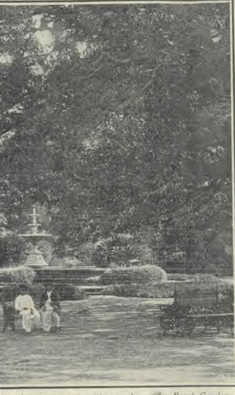
nots in or near our cities, such as the Bund Gardens at Poona, invite an early morning ramble.

in the Assembly Hall of the Education y O. V. Hellestrand, F.C.S. Lond.)