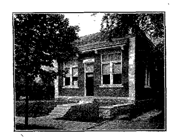
KANSAS CITY OFFICE

As we look over the reports month by month, we note that there is a gain in the sale of subscription books and in total monthly sales every month but three. A larger force of permanent canvassers has been in the field during