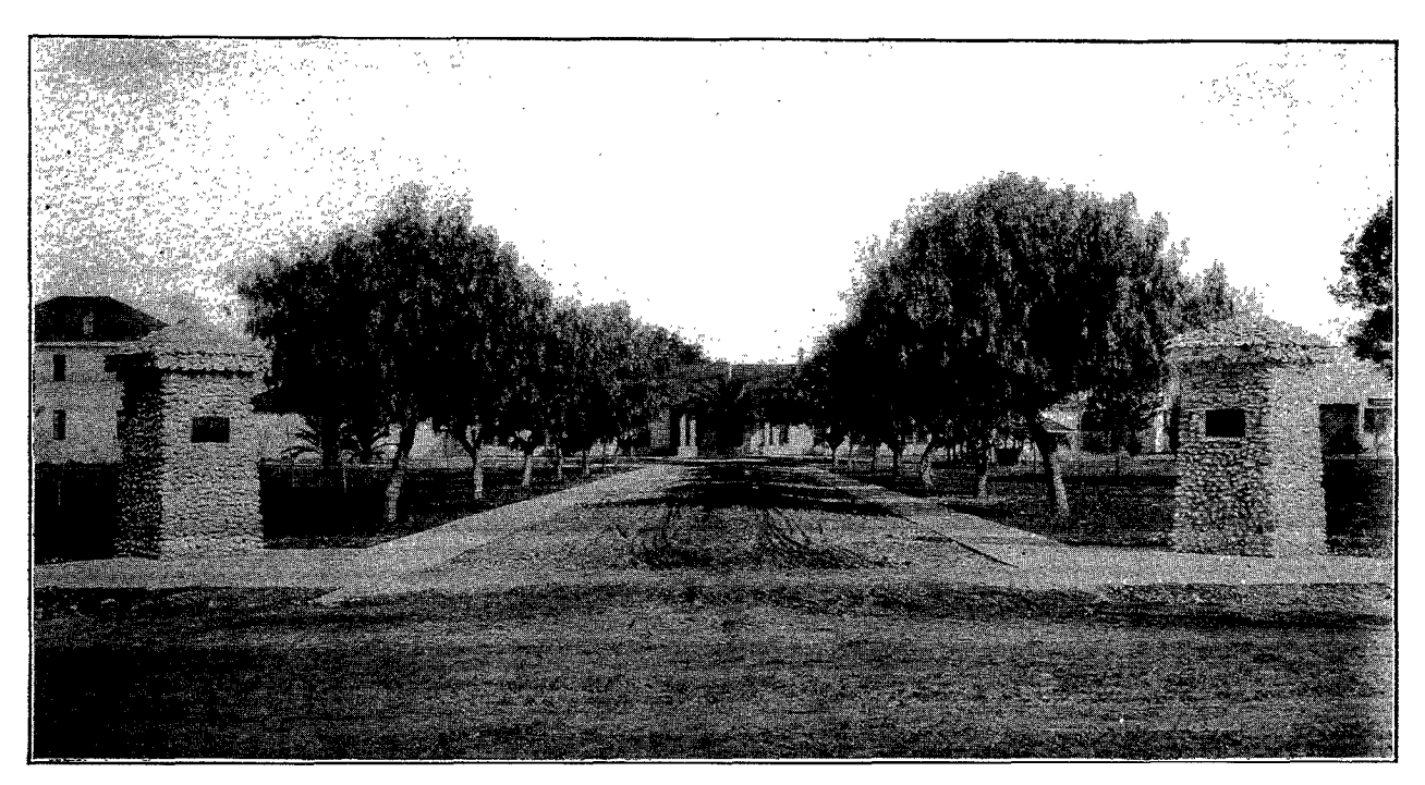
MAIN ENTRANCE TO PACIFIC PRESS PUBLISHING ASSOCIATION'S GROUNDS