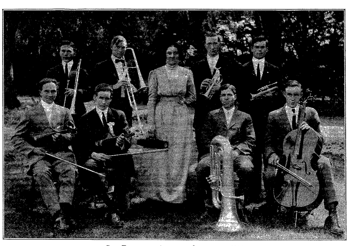
SAN FERNANDO ACADEMY ORCHESTRA 1914

"Let us do all in our power to make the San Fernando school a blessing to our youth. Teachers and students, you can do much to bring this about, by wearing the yoke of Christ, daily learning of Him, His meekness and lowliness. Those who are not directly connected with the school can help to make it a blessing by giving it their hearty support. . . ."