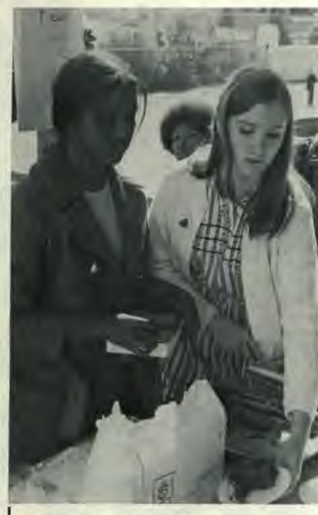
Students throughout the Pacific Union annually participate in projects to swell their Valentine offering to Faith for Today. Many hold bake sales, as did those students at San Francisco Junior Academy. From schools within the Central California Conference alone, Faith for Today received $2,482.81.

The call is again sounded for all Pathfinder Clubs in the Pacific Union to plan to assemble on Jnue 20-23, 1972, at Big Pine, California, for the Pacific Union Pathfinder Camporee. All Pathfinders and their leaders who can measure up to the high standards and requirements of this camporee are welcome.