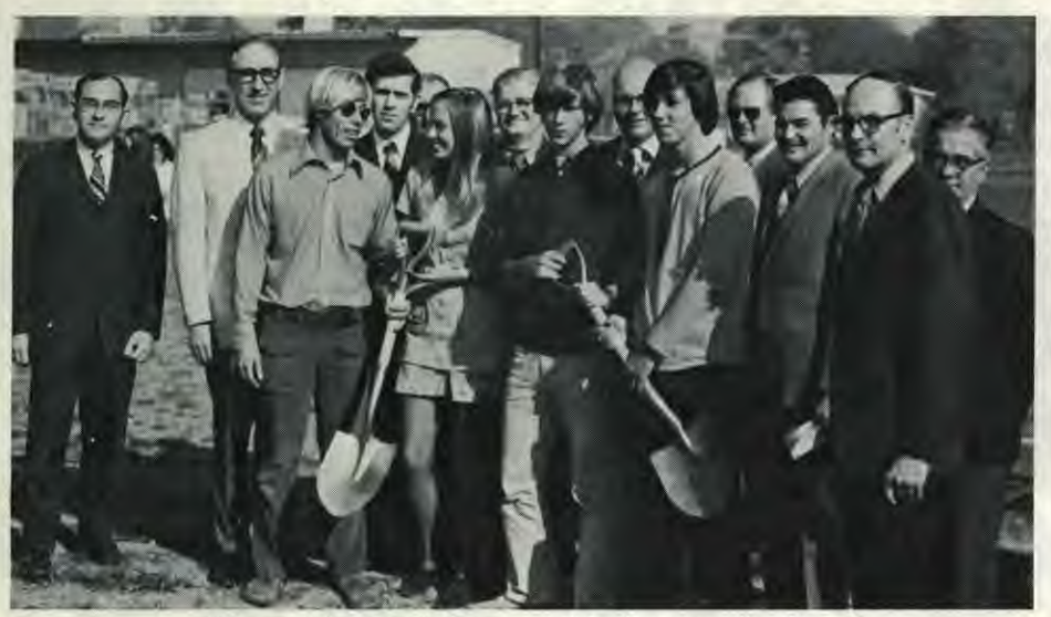
Major participants at the Orangewood Academy groundbreaking.