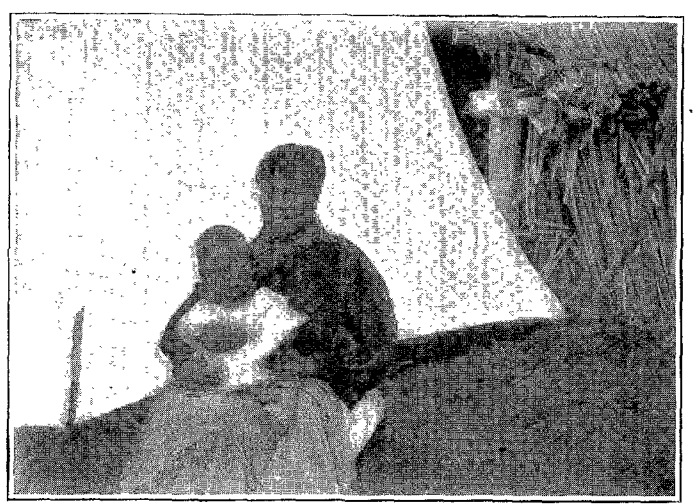
MAORI WOMAN AND CHILD

The Maori race have decreased from one hundred thousand to their present standing of forty thousand. They are now rapidly dying. This is, no doubt, largely owing to the evils introduced by white men. About three fourths of