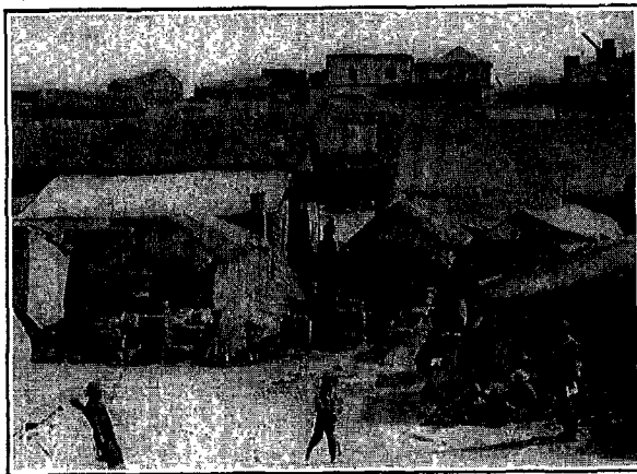
AN INDIAN VILLAGE IN BOLIVIA

THE message of Rev. 14:6-12 is making headway in our field. We are waiting to see the Lord do great things in France. For the past twenty-five years the message has been preached more or less, but with meager results. Two years ago the membership of this mission field was one hundred and fifty. Since then, one hundred honest souls have accepted the truth. Lack of workers has been the cause of the slowness of the progress in past years. At present we have a corps of strong, faithful young men and women, who are devoting all their ener-