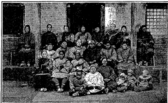
SISTERS ATTENDING GENERAL MEETING, SIANG CHENG

We all realize that the time has come for a great onward move in the work in China. Interest is awakened wherever the truth is made known. Up to the present time we have had practically no literature to use, and enquirers who can not come to our stations have no way to learn of the truth fully. Literature is greatly needed at once. To appreciate