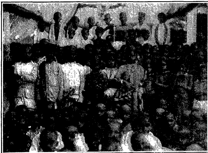
GROUP OF TAMIL CHURCH-SCHOOL CHILDREN

While much business was done, and many questions considered that would have a bearing upon the future of the work, and upon which the delegates had different views in the beginning, it was a noteworthy and often-mentioned characteristic of the conference, that there