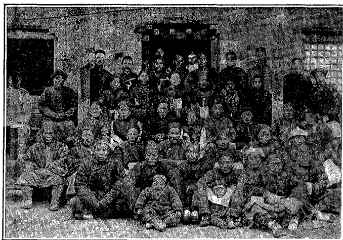
BRETHREN ATTENDING GENERAL MEETING, SIANG CHENG