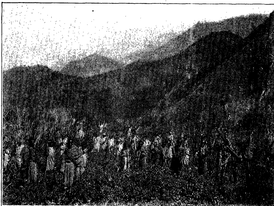
NATIVE GARDENERS AT VUASU, GERMAN EAST AFRICA

If a man can read, he may be given some Bible truth in print, and he is then constantly under the influence of that, according to the amount of time he spends in reading it. But these heathen can not read. Because of this, the missionary himself must be the open book for them to read, and it becomes necessary for him constantly to stimulate in them the spirit of inquiry, that he may instruct them about the texts they need.