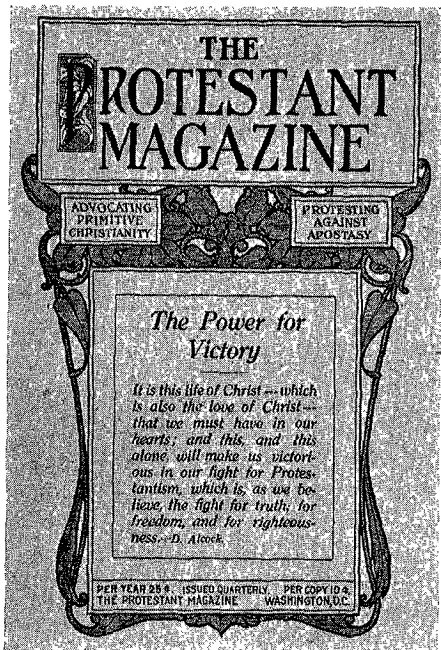
The Protestant Magazine Third Number

The Protestant Magazine , in dealing with the doctrines of the Roman Catholic Church, does not attack any member of that communion. There is a wide difference between exposing the falsity of a doctrine and aspersing the character of those who hold the doctrine.