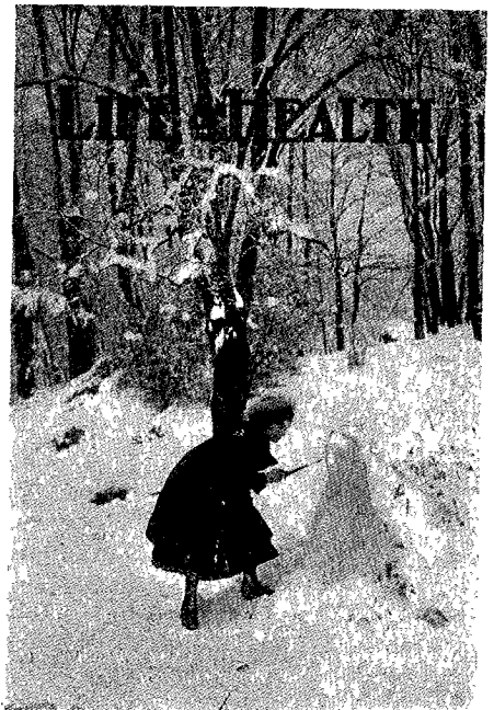
The December Life and Health Attractive and Unusually Instructive

The December number of Life and Health contains a volume of practical matter on a large variety of health topics, such as: Illustrated home physical culture exercises for contracted chest, round shoulders, development of the neck, stimulating the action of the blood-vessels, intestinal troubles, indigestion, development of the legs, the abdominal muscles, and other parts of the body; that which is necessary to render milk comparatively safe from the transmission of disease germs; the proposed cure for uric acid; how whooping-cough is transmitted, and the best treatments for it; how to treat boils; treatments for anemia and eczema; alcohol in the treatment of disease; suggested remedy for the cure of pellagra; mental healing; use of "day camps" in the treatment of tuberculosis; when milk is dangerous; cow's milk as infant's food; the relative compositions of various milks; concerning cancers; the best kind of materials for underwear; preventives of insanity; important things parents should know about the care of infants; public opinion and diet, and a large variety of other topics too numerous to mention.