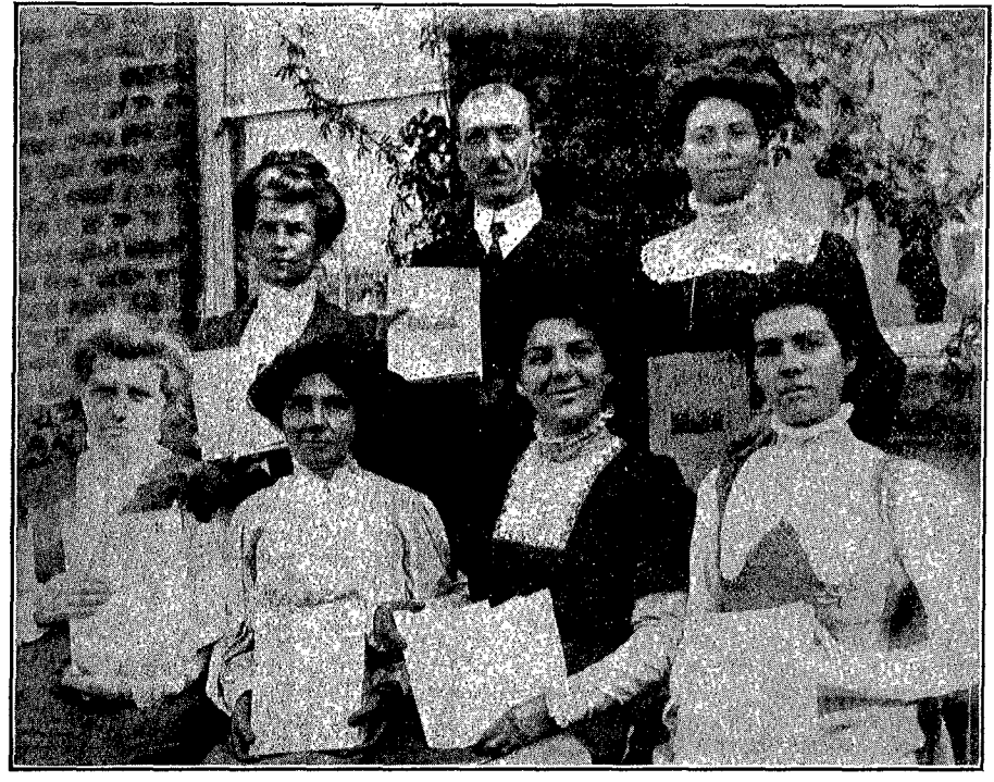
PAPER WORKERS CONNECTED WITH THE JOHANNESBURG CITY MISSION

One of our agents sold 95 copies one day and 105 on another, making 200 in two days. Another, who recently came into the truth, sold 75 copies on the street one evening after the Sabbath. This is a practical demonstration of what can be done by consecrated effort under the blessing of God. Perhaps all can not reach this standard in handling