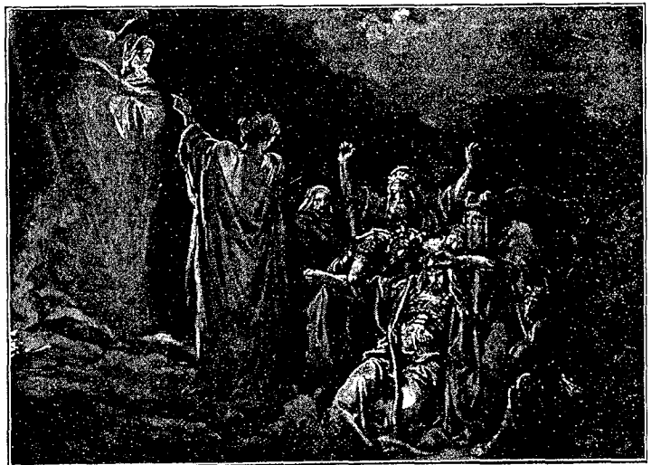
SAUL AND THE WITCH OF ENDOR

"When thou art come into the land which the Lord thy God giveth thee, thou shalt not learn to do after the abominations of those nations. There shall not be found among you any one that maketh his son or his daughter to pass through the fire, or that useth divination, or an observer of times, or an enchanter, or a witch, or a charmer, or a con-