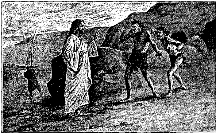
DEMONISM IN THE DAYS OF CHRIST

What then is there to conclude but that the devil is at the bottom of the whole thing? That the devil has always been contending against the Almighty for the allegiance of man, goes without saying. Indeed, there is much evidence in Scripture that the idolatry of the heathen was nothing less than the worship of demons. It is repeatedly asserted at any rate, that Israel in her apostasy offered her sacrifices unto demons, and Paul,