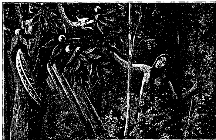
THE FIRST MEDIUM: THE SERPENT. THE FIRST LIE: "YE SHALL NOT SURELY DIE."

The very name of witchcraft is now held in contempt. The claim that men can hold intercourse with evil spirits is regarded as a fable of the Dark Ages. But Spiritualism, which numbers its converts by hundreds of thousands, yea, by millions, which has made