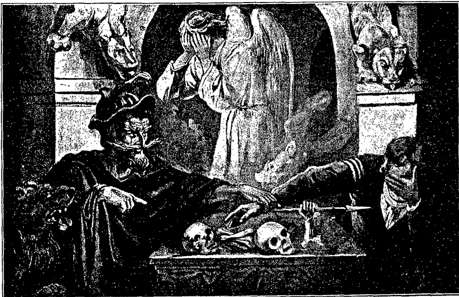
OUR "ADVERSARY THE DEVIL," "SEEKING WHOM HE MAY DEVOUR"

Yes, you may get it back. Go alone with God — you don't need any medium — and listen to the whisperings of his blessed Spirit, and he will guide you home.