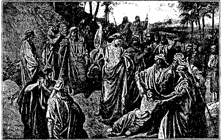
CHRIST CASTING OUT A DEVIL

Indeed, we find from the Word of God that even in the earlier ages of mankind Spiritualism was not a thing unknown. In the Old Testament you will find a great variety of words each designating some particular phase of spiritualistic phenomena. It would take