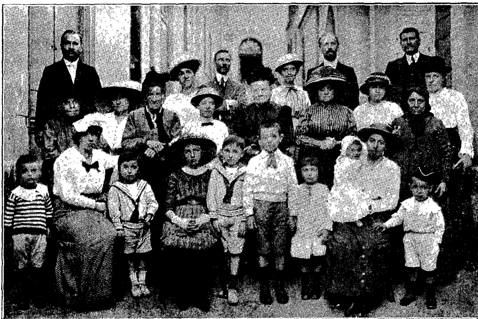
GROUP OF BELIEVERS IN ALGIERS, NORTH AFRICA Taken in 1915

In the province of Oran about the same number of European nations are represented, but the field is very different. Here Spanish is spoken so extensively that I am obliged to preach in that lan-