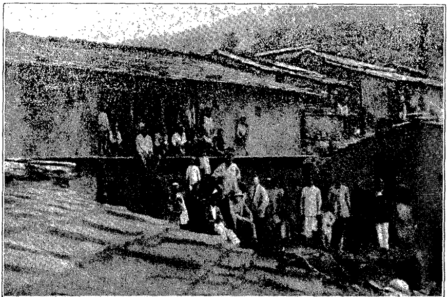
A VILLAGE IN THE HIMALAYAS, NEAR THE GARHWAL MISSION SCHOOL

Recently, during the days of agitation in India, the minds of many of the people turned to the possible changes that might come about in government, and there were questionings as to the fulfilment of old-time prophecies. A small book in Bengali on the coming of Christ, fell into the hands of some Moslems, and was passed from one to another and eagerly read.