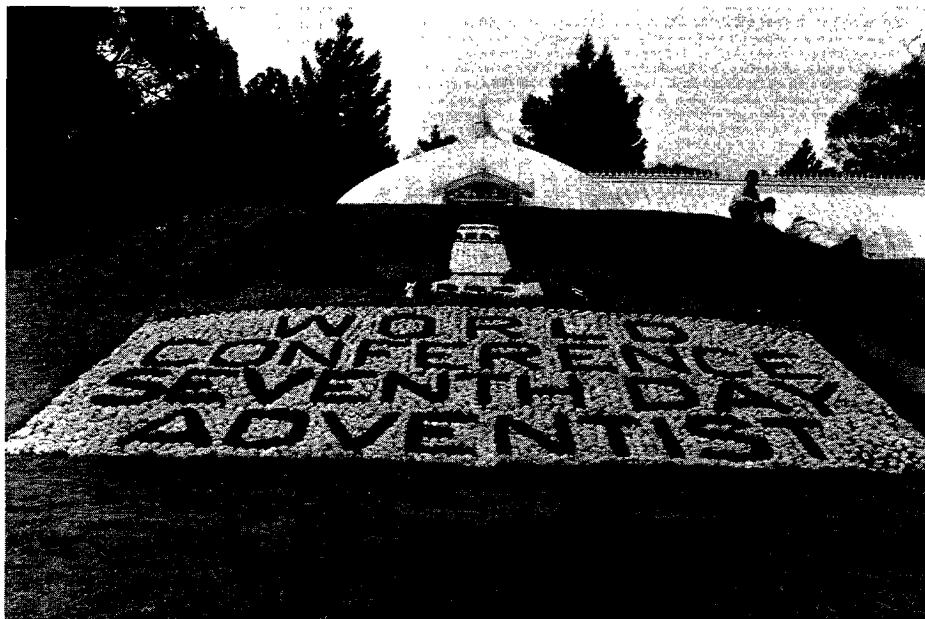
A beautiful floral display in honor of the General Conference session brightens a grassy slope in Golden Gate Park, San Francisco. The background flowers are pale, grayish green, with the lettering in vivid red.