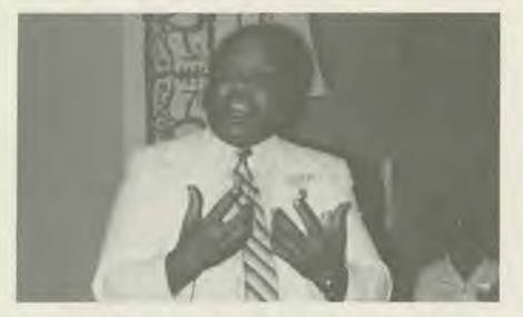
In one of his heart-touching sermons he admonished that the devil is saying to eat the pig; "eat anything you want, it's good for ya!"