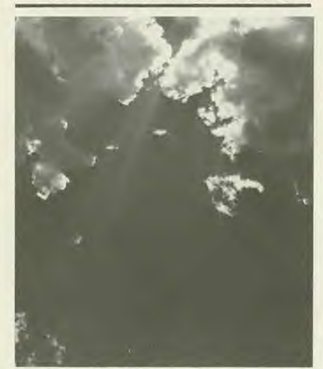
Photographer Barbara Loudis' impression of the magnificent 'corridor through the sky."