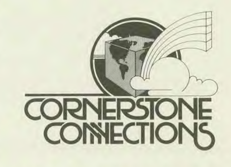
WATCH ... FOR MORE INFORMATION!