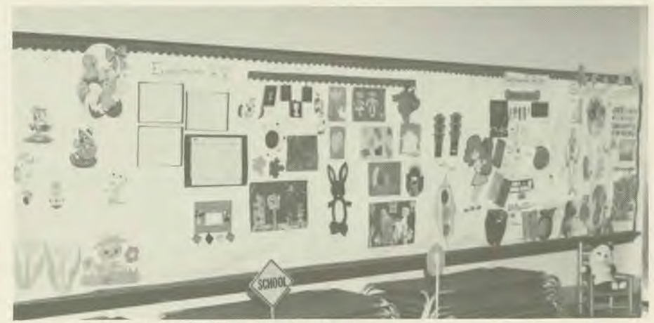
Nursery equipment at Watkins Christian Academy.