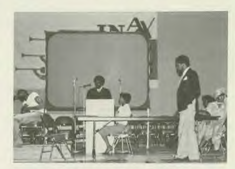
South Central "Youth for Better Living" group presents a program on crime prevention to the congress.

The single most impressing feature at the congress, according to our delegates, were the seminars. Most of the delegates couldn't wait to return home to tell how richly they had been blessed.