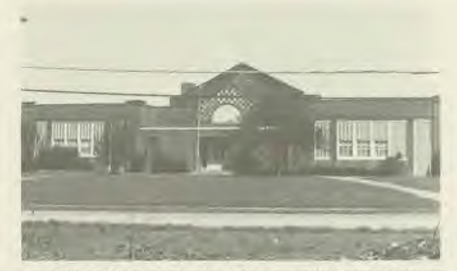
Watkins Christian Academy of Youngstown, Ohio, Allegheny West Conference.