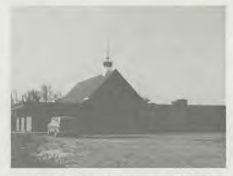
The new College Hill church in Rockville, Tennessee.