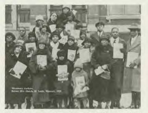
Missionary workers from the Berean SDA Church in St. Louis, Missouri, in 1929.

hailed with joy by our white Adventist believers presuppose a conference directed by Negro officials?