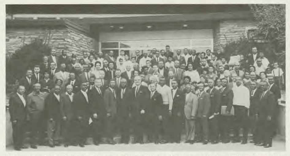
One highlight of black SDA history was the 1965 tri-conference worker's meeting held in Ardmore, Oklahoma. The conferences involved were South Central, Southwest Region and Central States.

Civil and post-Civil War days (1863-1883): The second twenty years of Adventism enjoyed the blessings of heaven. Battle Creek College and Hos-