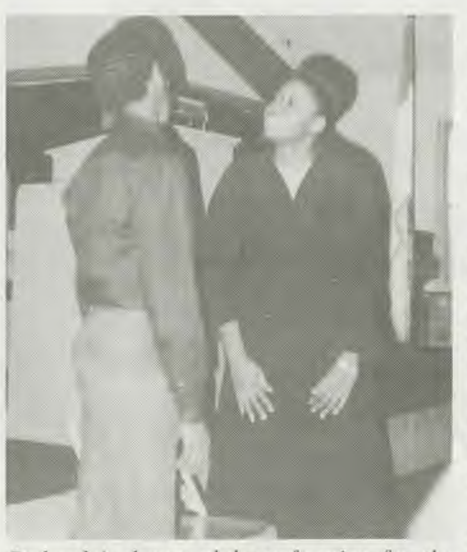
Bethesda's drama club performing for the AY Society.