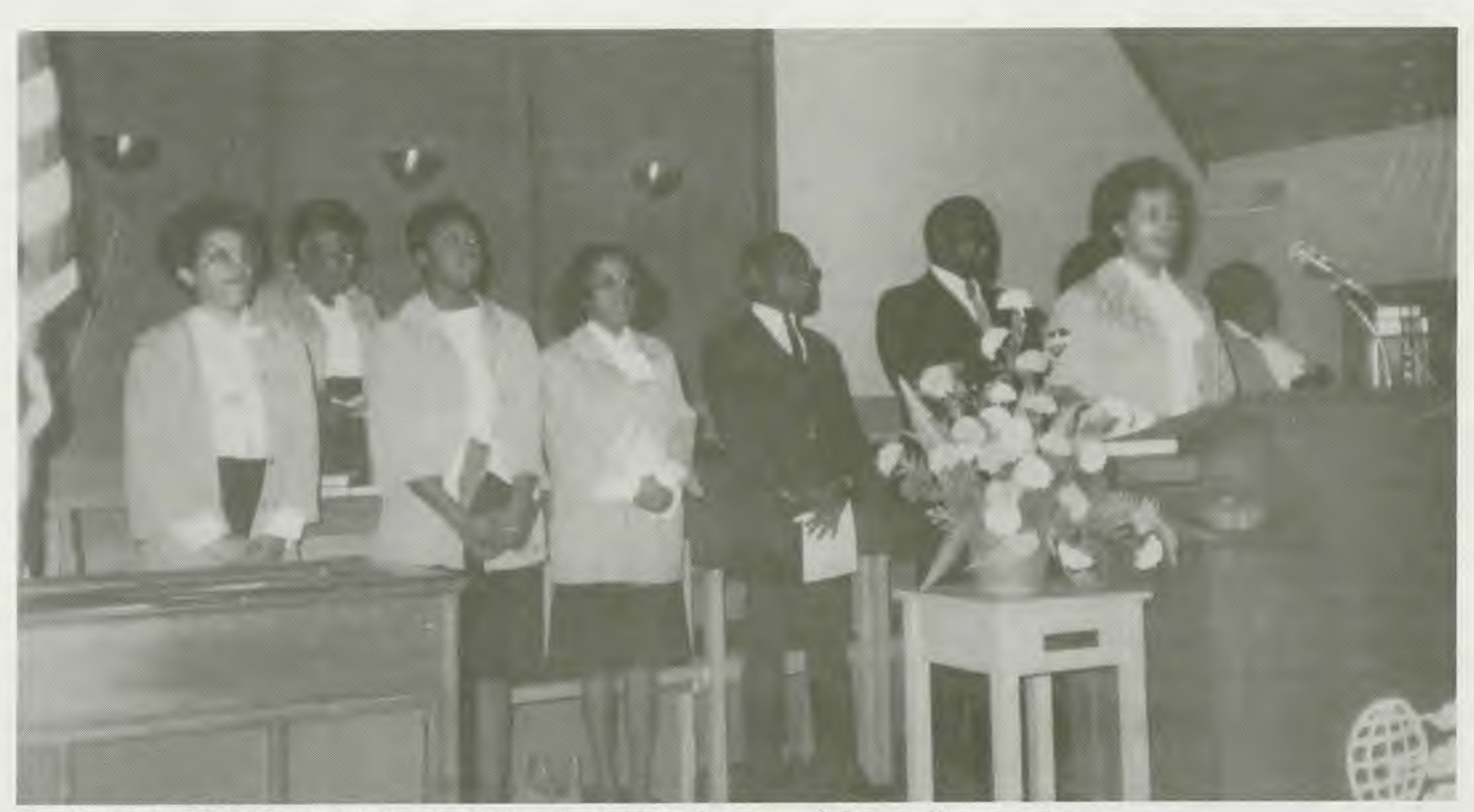
The Bethesda SDA Church of Omaha, Nebraska, held its first annual Dorcas Day program.