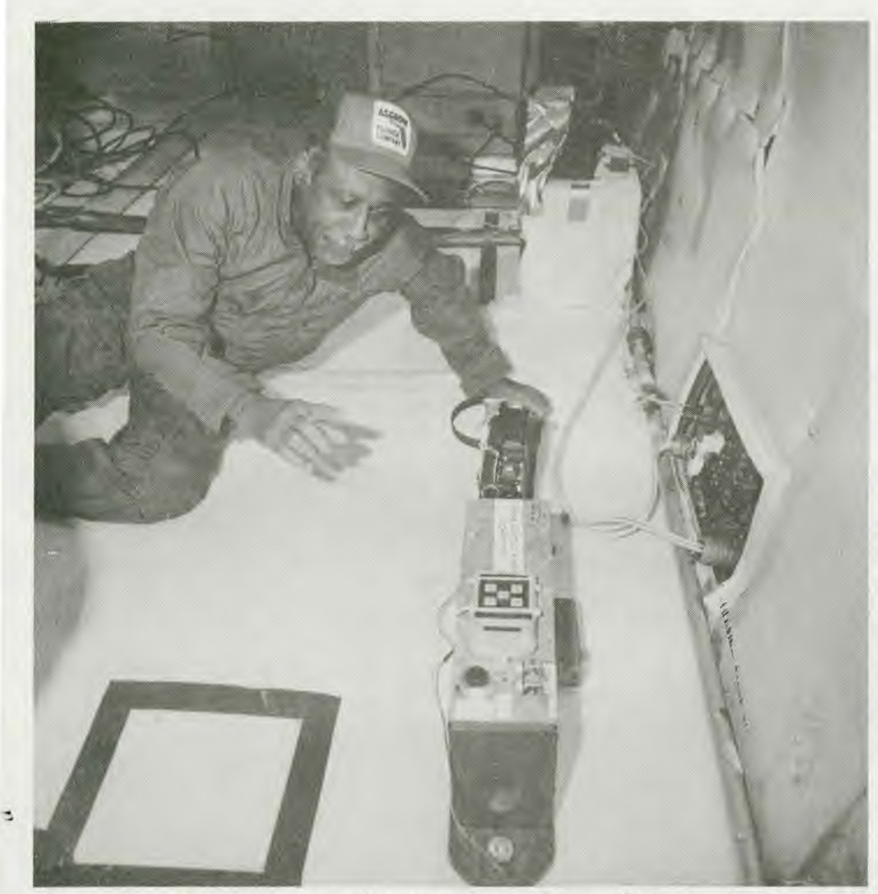
An experiment to determine critical contact points with a specific fluid and welding angle.