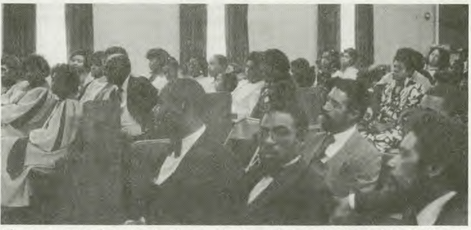
The congregation listens during Community Guest Day at the Mount Calvary Church, Williamsburg, VA.

On a perfect Spring Sabbath, cars ar- rots and several flow rived from every direction to attend the of the items planted.