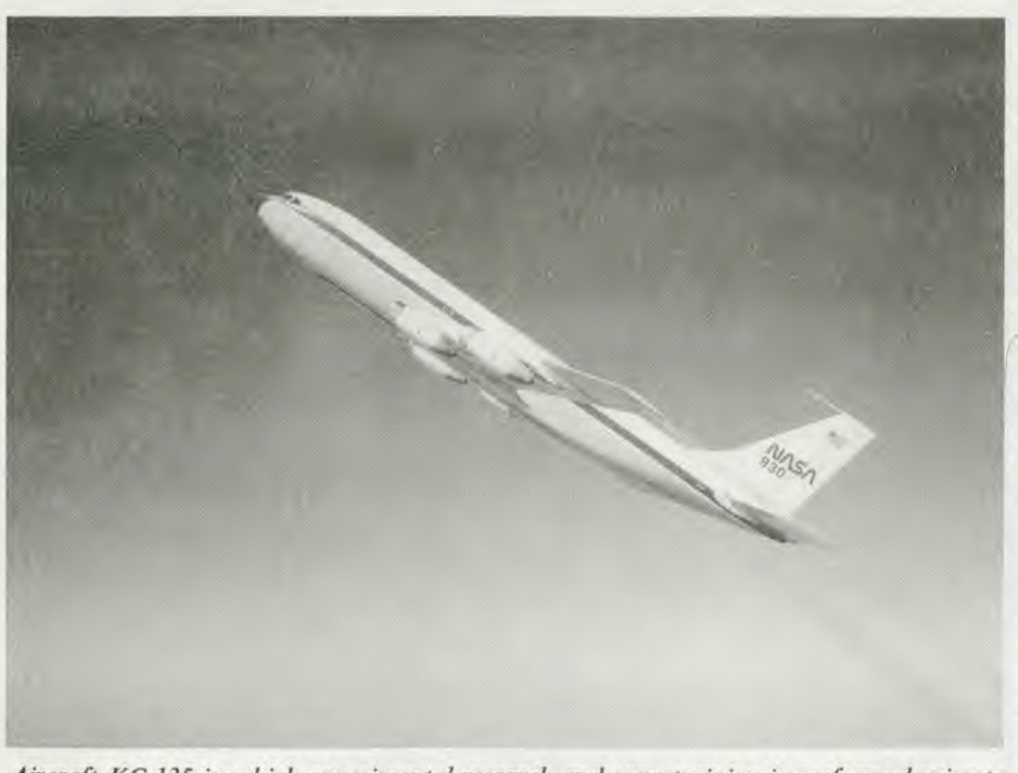
Aircraft KC-135 in which experimental research and crew training is performed prior to shuttle flights.