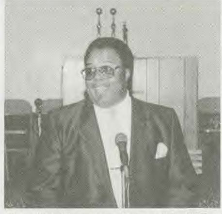
Grove Church, added his talent to make the inspiring Sabbath School lesson. Harvest Program a success.

3. That a Media Support Group with a minimum membership of 500 persons be established and that they