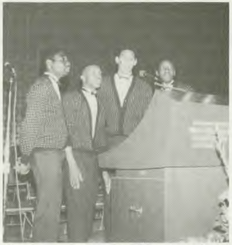
Quartet presenting special music at Youth Congress.

In a written message to the youth, Elder Baker summed up the purpose of the congress. "This congress is designed to help you appreciate your common bond as Seventh-day Adventist young people, and to challenge you to live out the uniqueness of the Advent message. We live in an age when there is an ever present quest for change and for something new; and many times change is brought about at the expense of those things which are basic to the moral fiber of society and the church; but as young people of prophecy, we cannot allow ourselves to be swept up by the tide of the times."