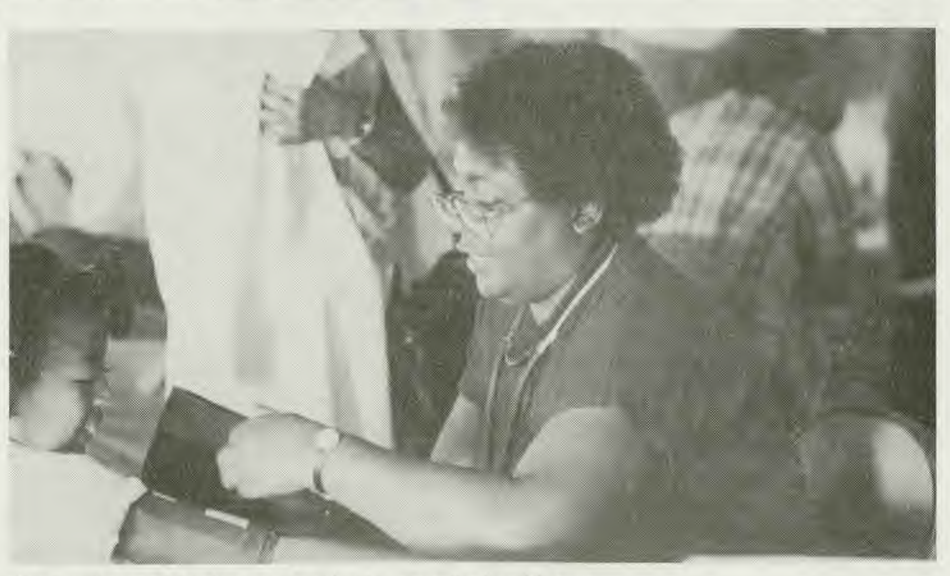
A camper gets blood pressure check-up at the health tent.