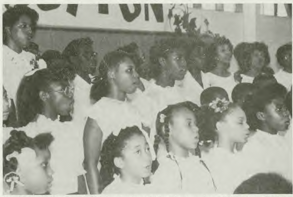
Combined choirs from the Linden Boulevard Church, Laurelton, NY perform during a divine worship service.