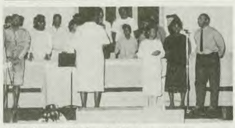
The Park Hill Youth Choir perform during their local Temperance Run-off.