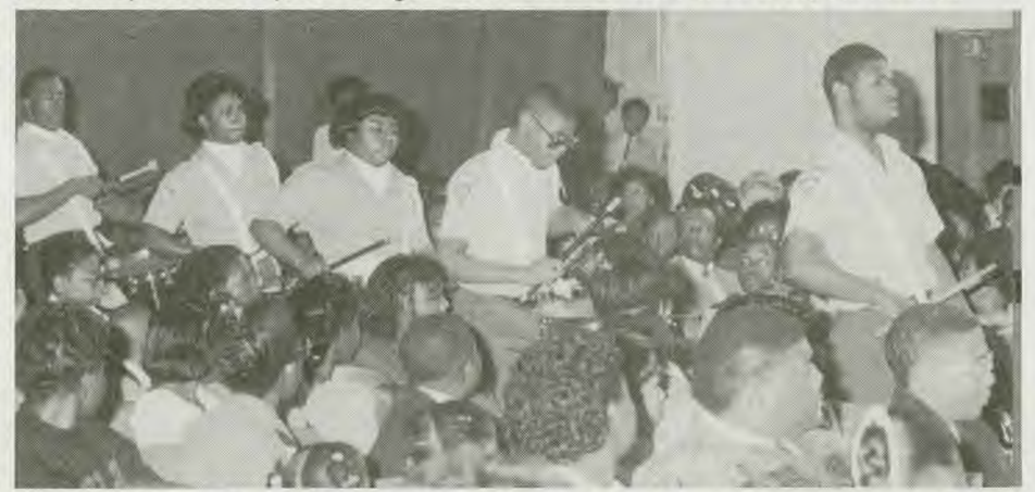
Ebenezer Church Drum Corps, leading the processional for the Divine Worship Hour.

Encouraged by the neighborhood response, the church plans to repeat this event at least once every six months.