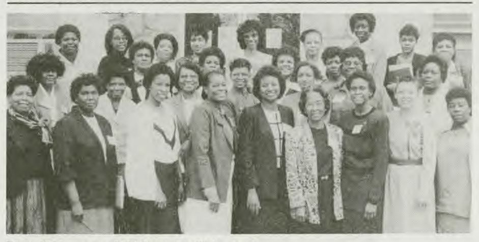
Black SDA nurses of NAD meet at Oakwoood.