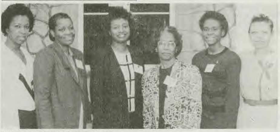
Officers of Black SDA organization.