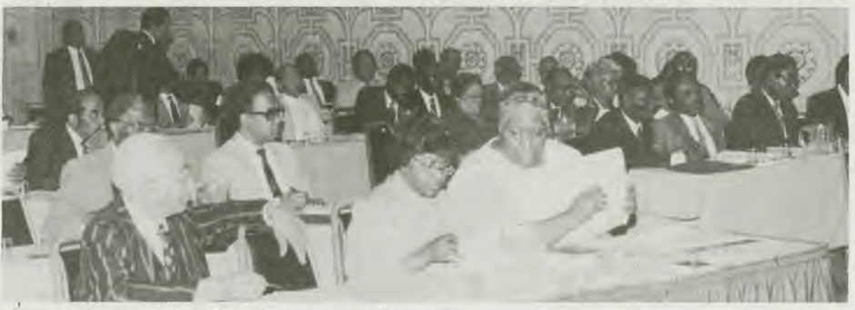
A partial view of the Risk Management Seminar.