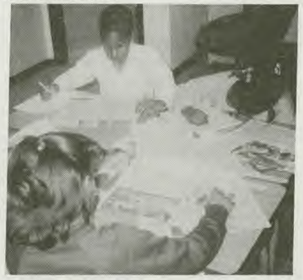
Students learn from newspapers at Alcy.

The total cost of construction was approximately $540,000. The members have rallied behind this building venture with true dedication.