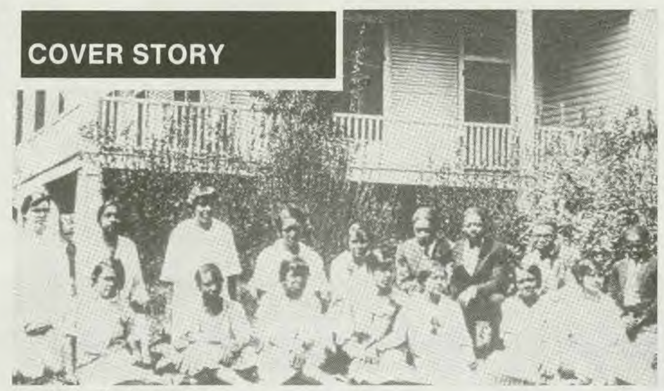
East Hall—The Sanitarium.