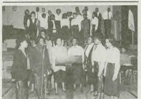
Northeastern Academy Choir performs during Black History Celebration.