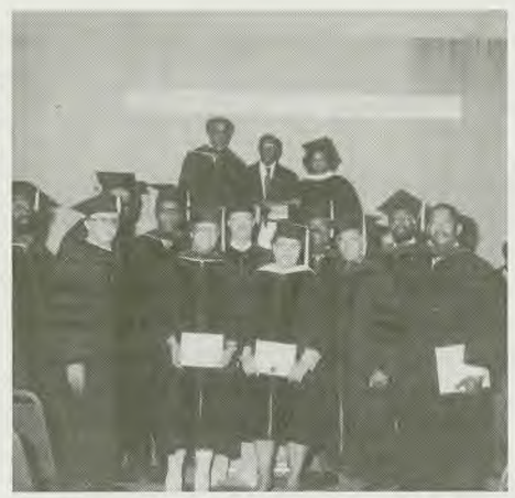
Doctorate degrees conferred on SDA leaders along with others.

Blessed be the LORD God of Israel from everlasting, and to everlasting. Amen, and Amen.