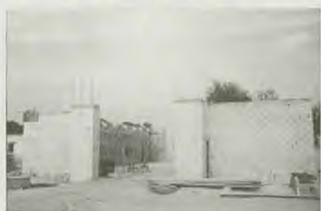
North Orlando SDA Church under construction. Opening scheduled for July, 1988.