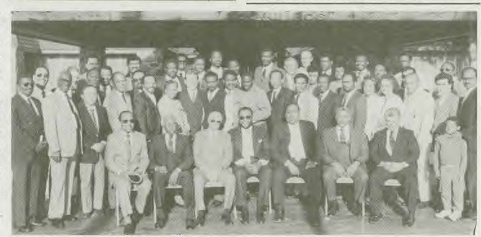
Workers of Lake Region Conference attend retreat in Indiana.