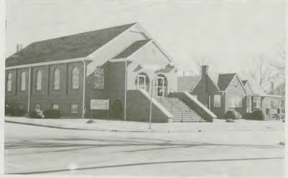
Newly purchased church in Bessemer, AL.