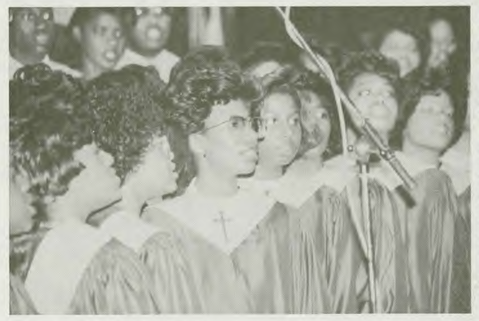
Members of the Pine Forge Academy Choir.