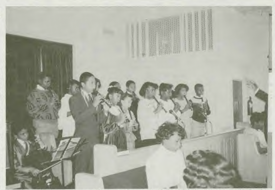
Alcy Recorder Ensemble provides special music for Sabbath School during "Alcy Day" at Breath of Life.