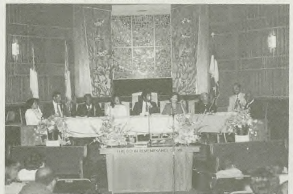
Surrogate Motherhood Implications for the Church, topic of panel discussion during the 10th Anniversary of the Church of the Oranges.