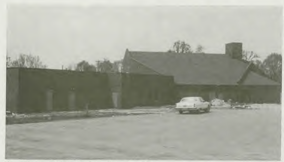
New Covenant Church building, Memphis, TN.