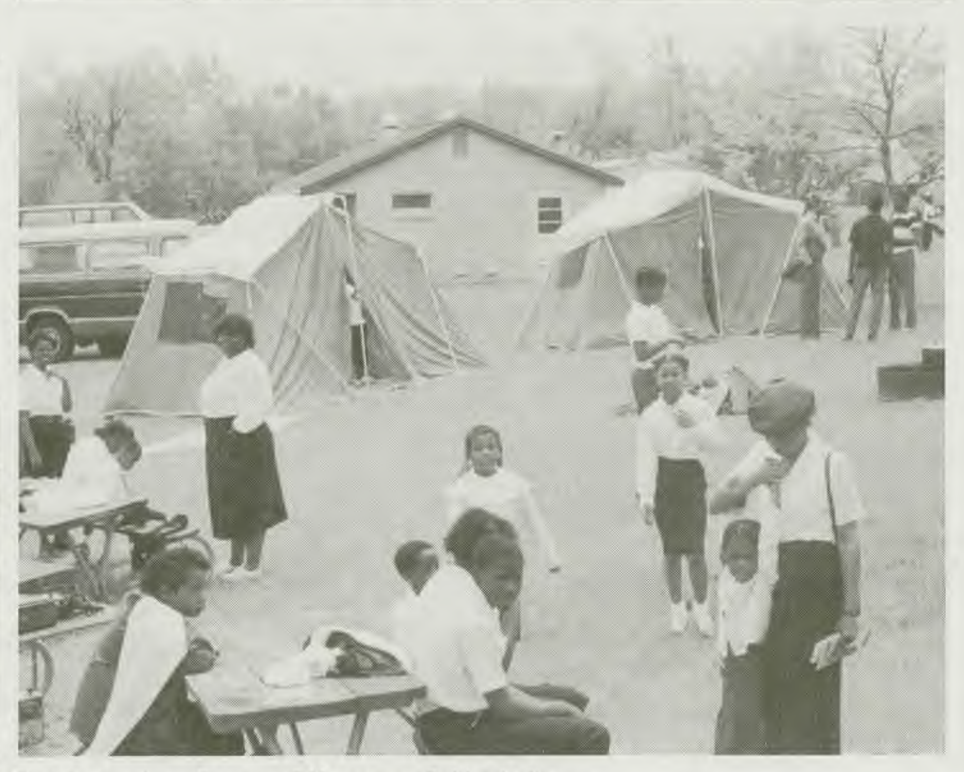
Pathfinders from Dayton, OH, wait on Sabbath dinner.