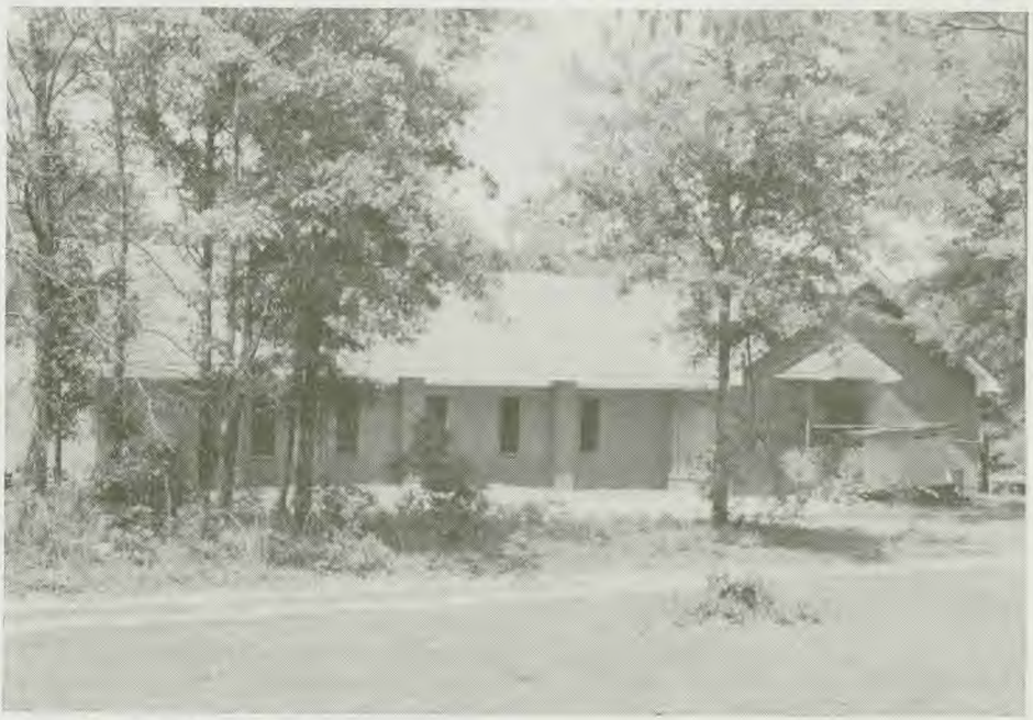
New church building, Daphne, AL.

When the Black leaders came together, requests were made to the parent bodies