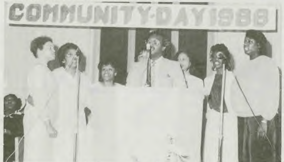
The Testimonies perform for Community Guest Day,

March 26 was Community Guest Day as well. Dinner was served for family, friends and guests. The AY Society and Personal Ministries Department went into the community to distribute food to the less fortunate.