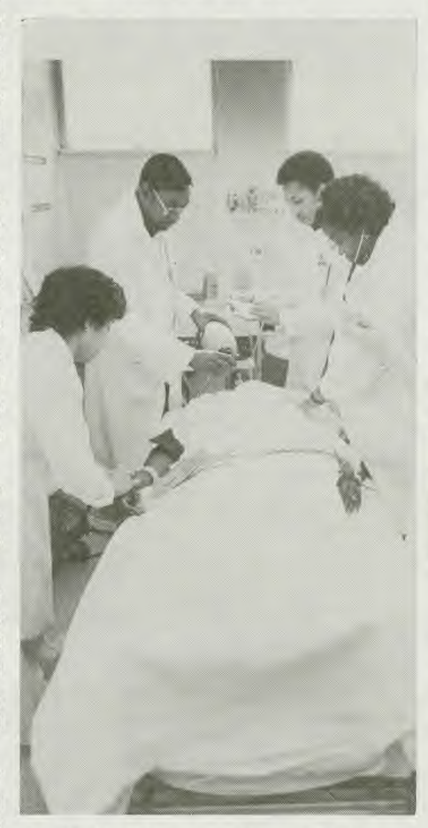
Qualified staff personnel use their life-saving skills.

pulse of the community. These busy, caring people from professional to blue-collar workers, focus in on modifying old ways and identifying new ways to approach Washington's poorest section, Hadley's Memorial Hospital's neighbors.