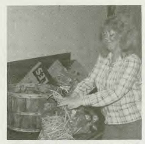
A client selects fresh vegetables and fruit.

wait to be served. To supplement the video presentations, Voice of Prophecy enrollment cards, Message Magazines or health brochure are placed in every box. A young man returned one afternoon and asked, "May I have another one of those magazines for my mother? She wants one also."