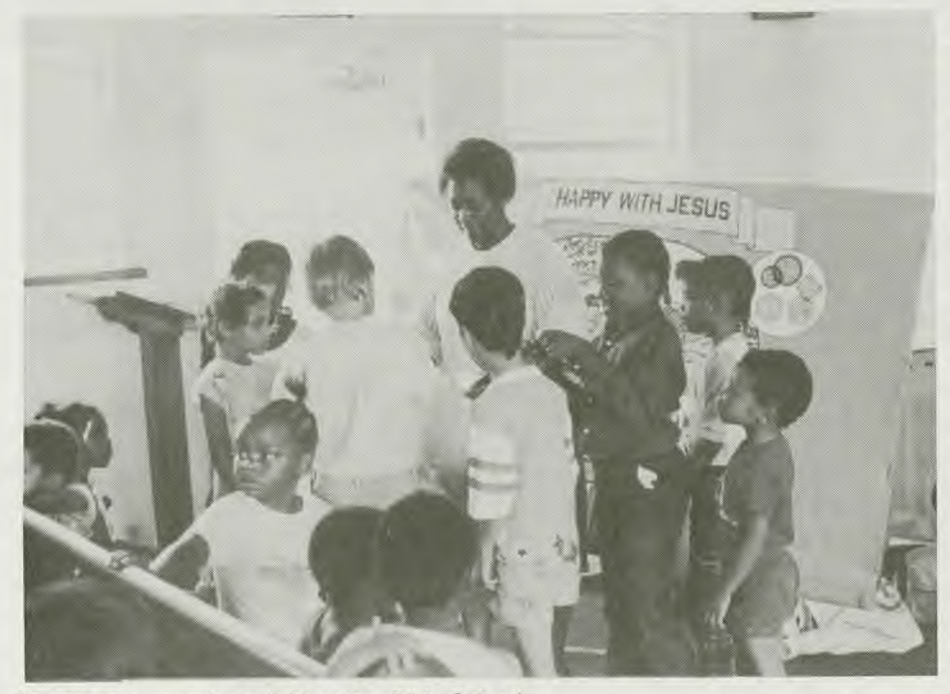
Youngsters participate in Vacation Bible School.