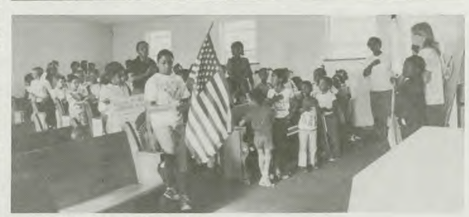
Vacation Bible School at Palace of Peace.