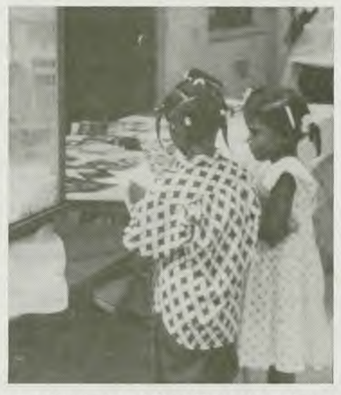
Two little ladies of West Philadelphia trying to decide whether to read or eat.