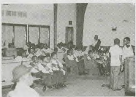
West Philadelphia's Pathfinders present "Life-Body" dramatization during AYS.

"Let not your hearts be troubled; believe in God, believe also in me." John 14:1 RSV