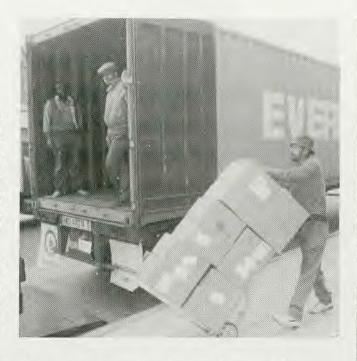
Volunteers load trailers to be sent to Jamaica, W.I.

The conference also donated money to Project Help, which is a privately run agency set up to help very needy individuals.