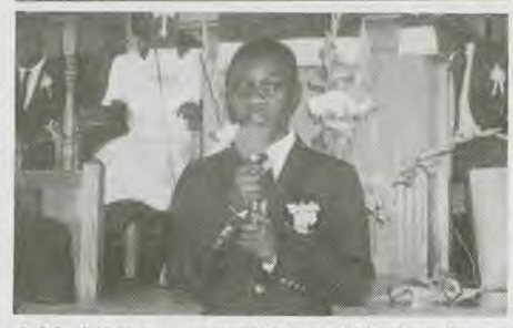
A Mt. Vernon youngster participates in Children's Day.