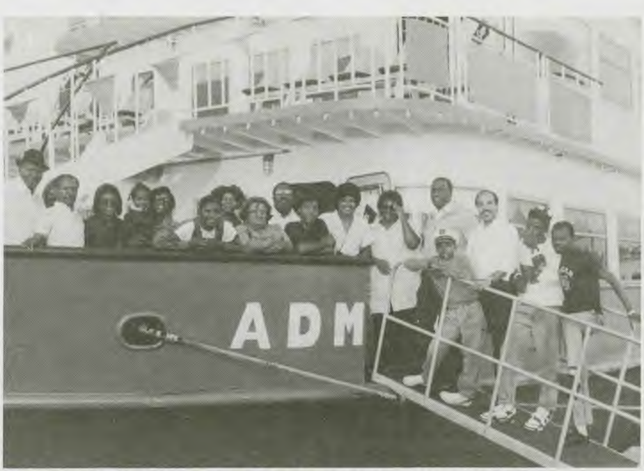
South Central literature evangelists rest from their labors during the year-end convention in Tampa, Fla.

When the Black leadership of the North American Division of the General Conference met in November of 1988 an action was taken to ask the clergy and laity to join