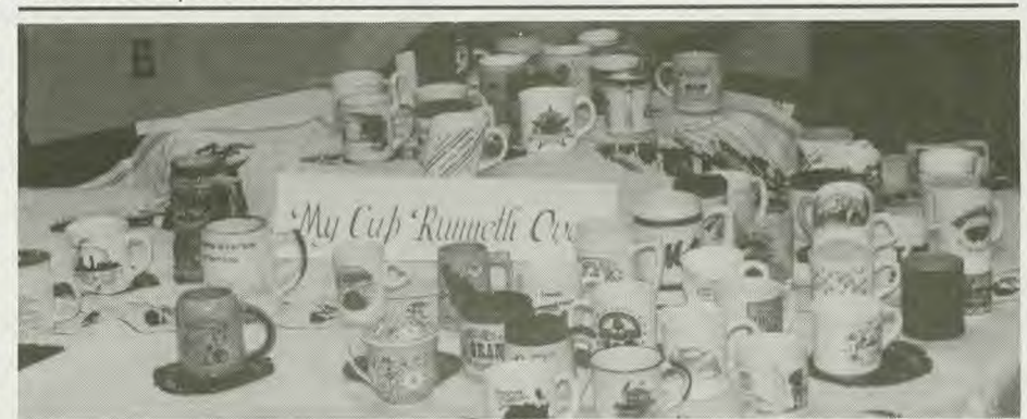
A display of mugs by Mrs. Celeste Bridges during the Art and Poetry Show.