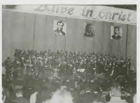
Mass choir performs at Minneapolis Council.