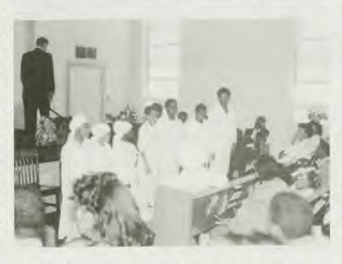
F. H. Jenkins students are baptized.

and reflecting upon the goodness of God.