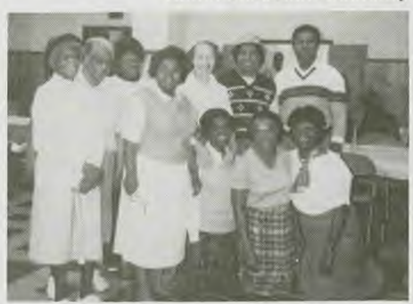
The volunteer staff of the Mt. Vernon Soup Kitchen.