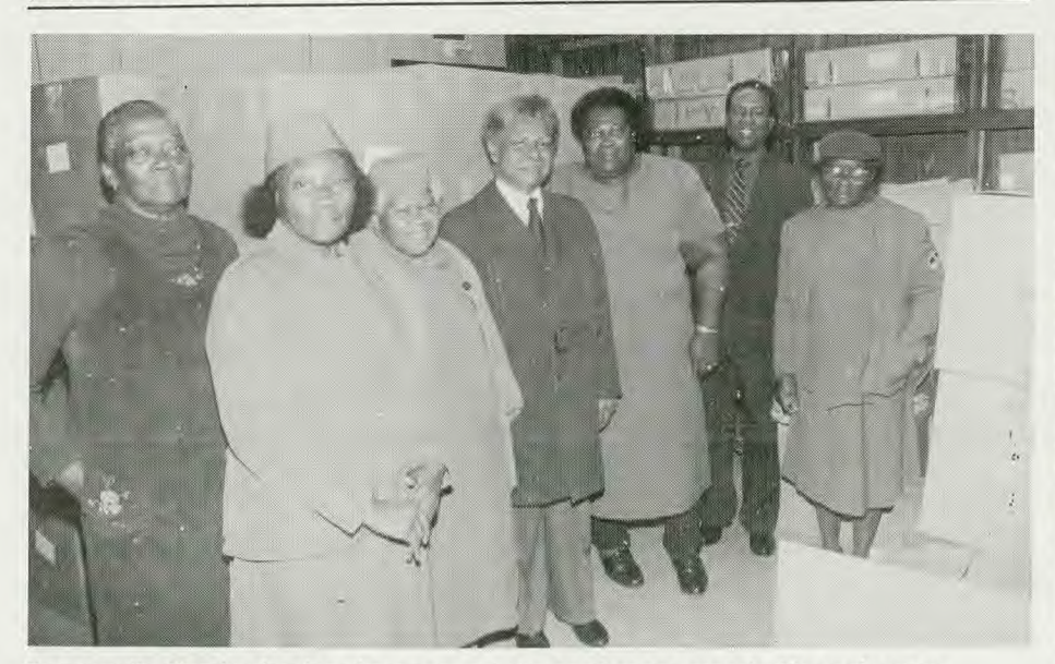
Community Service leaders from around the conference stand with conference officials, surrounded by food and clothing solicited for the disaster relief program.