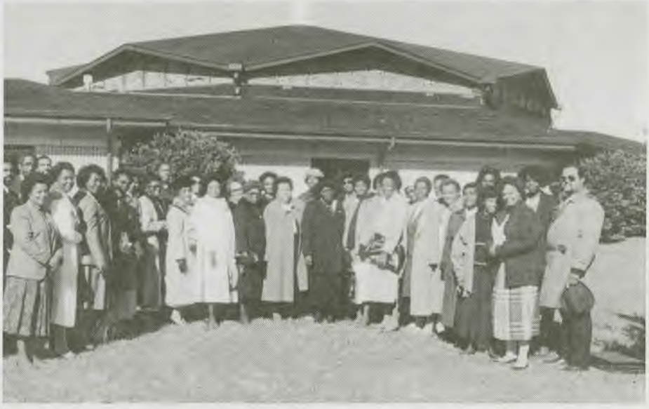
Bible instructors from across the continent meet at the time of the Evangelism Council.

hands for a finished work by accepting a goal to bring the memberships of the Regional Conferences to 220,000 by the time of the General Conference Session that is to be held in Indianapolis, Ind., during 1990. The objective can be reached as each congregation accepts a church goal to increase its membership by 15 percent of what it was during the end of 1988. Evangelism, it was agreed, is our real mission and every leader returned from the Council on Evangelism with a prayer that the Lord will use them to do even greater works than these.