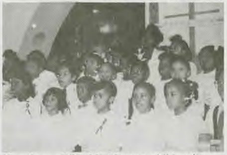
Members of the Mt. Vernon children's choir perform during the Divine Worship hour.