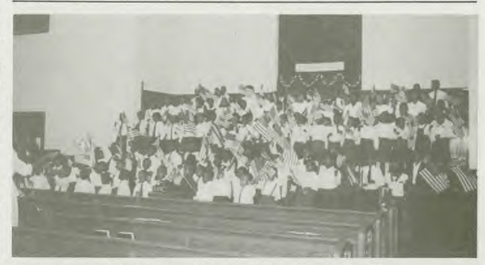
Alcy students sing during the special musical presentation on Oct. 22

Junior Academy students in the afternoon. The students were dressed in red, white and blue with individual flags. Patriotic songs of the Afro-American as well as the American experience were sung by the student body.