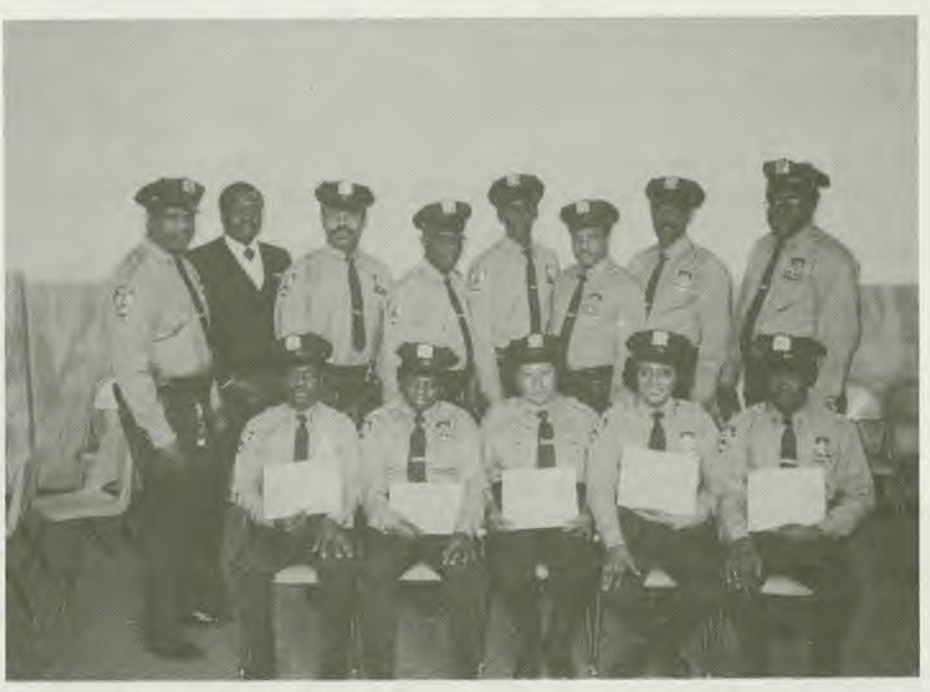
The Hanson Place Auxiliary Police.

For many years the members of the Hanson Place Church had been bothered by thieves who broke into their cars during worship services and for many years their