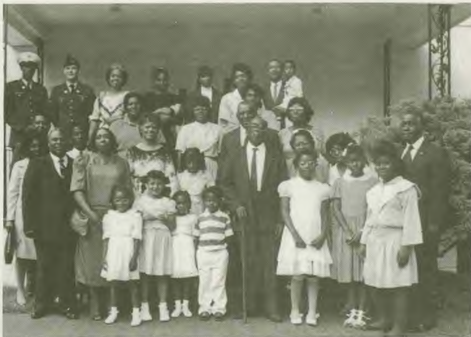
Some of those fed by the "I Care Ministry" stand with some of the members and pastor of the Norwood SDA Church in Birmingham, Ala.

With this in mind, and a burning desire to do something for the Lord, Norwood SDA Church members in the summer of 1987 organized and distributed sandwiches to the surrounding community. Out of this collective effort and seeing that a need existed, members decided to band together and develop a permanent ministry that would not only provide for the spiritual needs of the community, but also the physical needs.