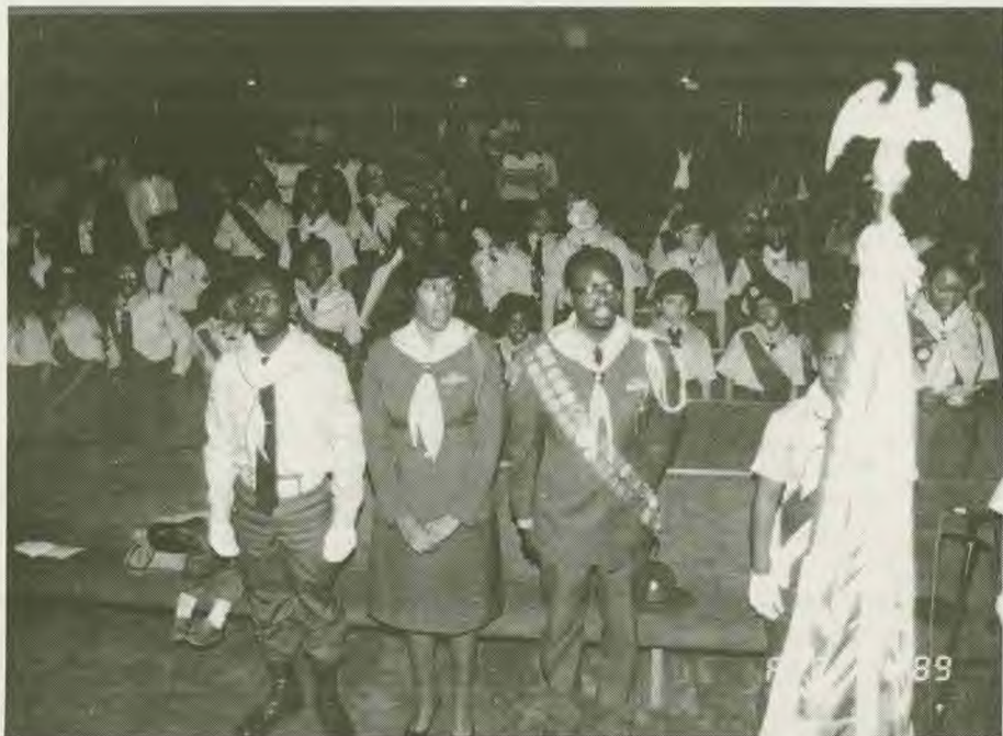
Ephesus Trailblazer Pathfinder Club.

Although the Trailblazers have been recently revitalized, the club is very active.