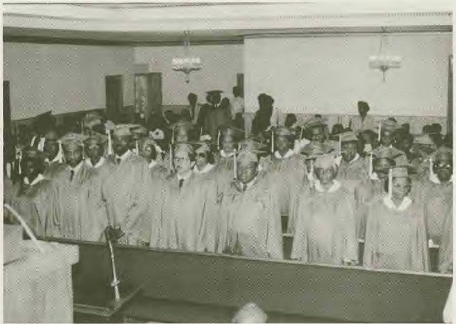
Graduates of the Brooklyn Temple teacher training course.