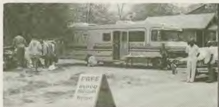
Macedonia's Give-Away Day.