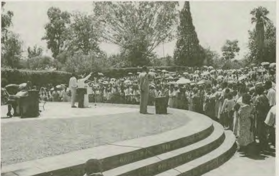
Some of the hundreds that took their stand for Jesus.