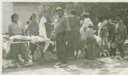
Community residents look for clothing items.