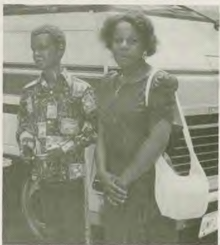
A visitor to the Give-Away Day participating in the Smoking Sam demonstration.