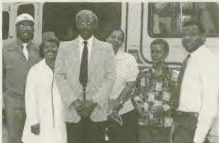
Macedonia's Give-Away Day van staff.

A play, "A Star in My Crown," was the main feature of the afternoon program. Following vespers, a social was held to climax the day's activities.