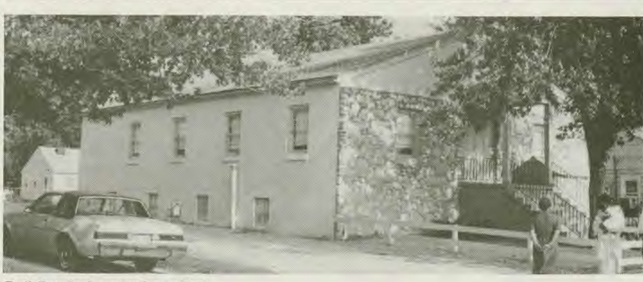
Building to be purchased at Owensboro, Ky.