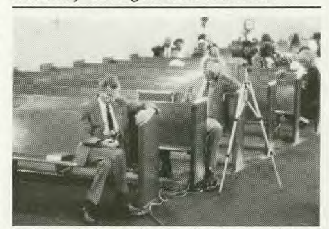
Public relations director for Pacific Union attends Regional conference session.