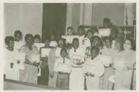
Graduates of the Real Truth Bible course.