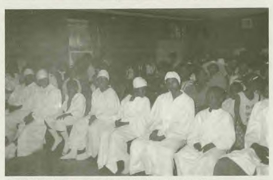
A partial view of baptismal candidates of the Better Way Crusade.

vation project to restore and preserve its sanctuary.