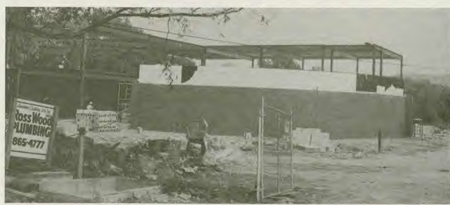
Conference office building