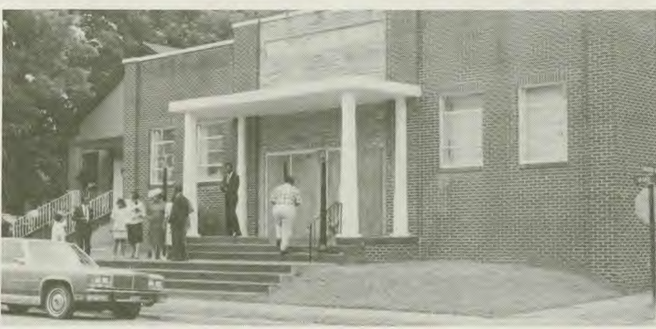
Building opened in Gadsden, Ala.