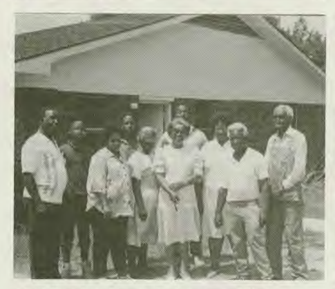
Building begins at Sylvarena, Miss.