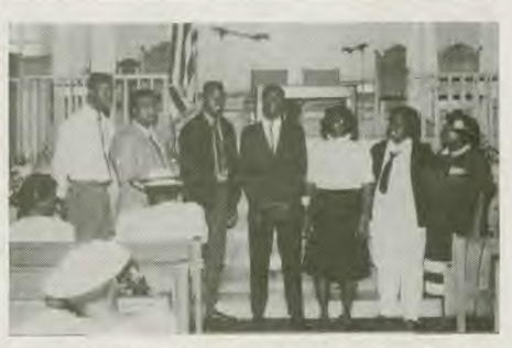
Young people render a musical number for the afternoon Youth Day program.