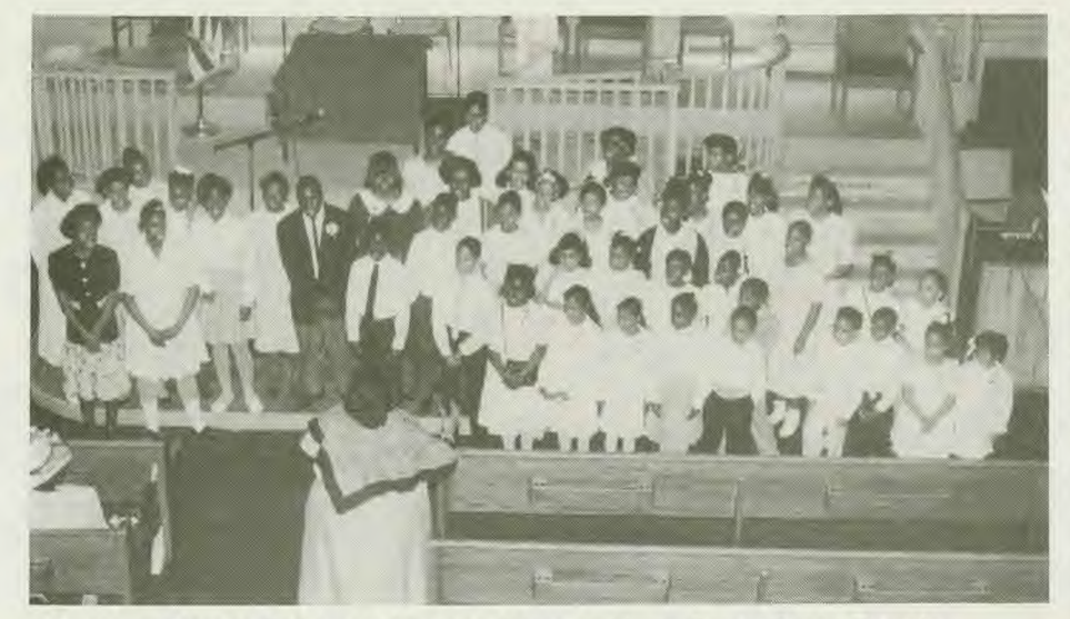
The Mount Vernon Children's Choir performs on Youth Day at Bronx Temple.