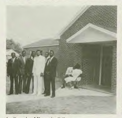
Indianola, Miss., building.