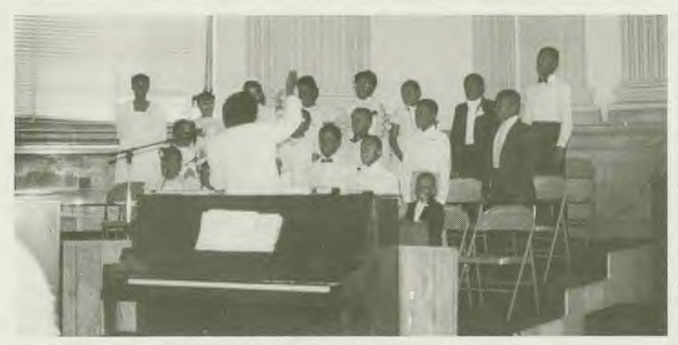
The Bronx Temple Children's Choir performs for Children's Day.

A skit was presented by Bronx Temple entitled, "When Congress Passed the National Sunday Law."