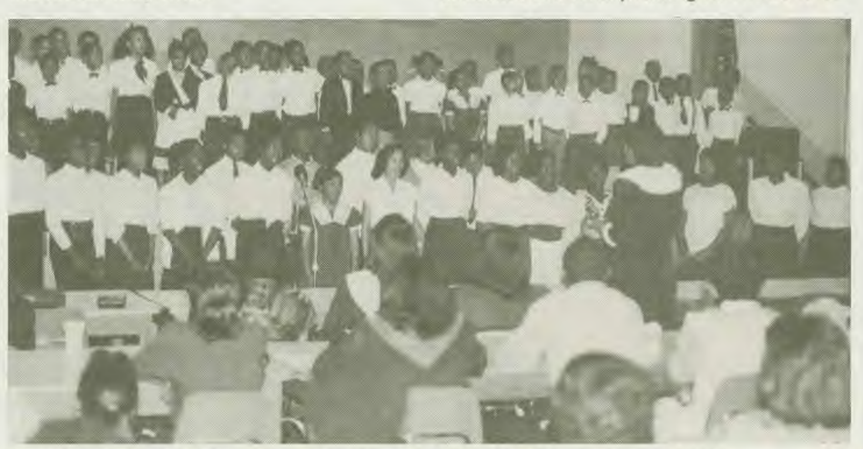
Alcy students presented evening vesper concert at Graceland Junior High School

The third grade class was housed in the portable classroom that is located directly behind the present elementary building. The portable building has 672 square feet with individual climate controlled heating and air conditioning. It is connected to the main building with a covered walkway. Monies for the purchase of the portable building was paid for by the members of the Breath of Life SDA Church. This purchase was initiated by the members of Breath of Life in order that more of their children could enroll at Alcv for the 1989/90 school year. The setup and installation cost of the building was paid for from funds raised through the Alcy Expansion (ALEX) Fund that was collected over the past eighteen months.