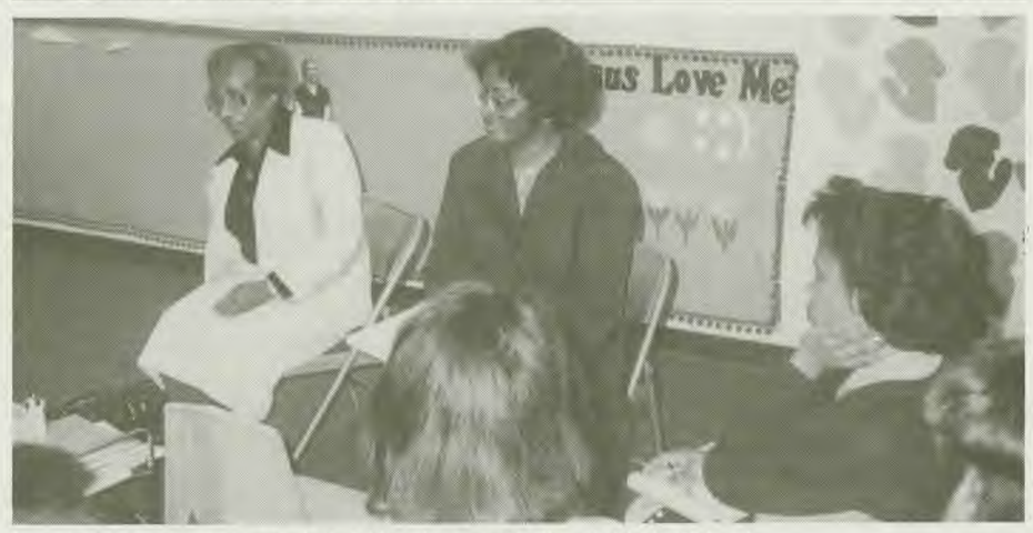
Lower division leaders gain helpful tips for an effective Sabbath School

Training and educating new members and officers in regards to their role and responsibilities was also a need.