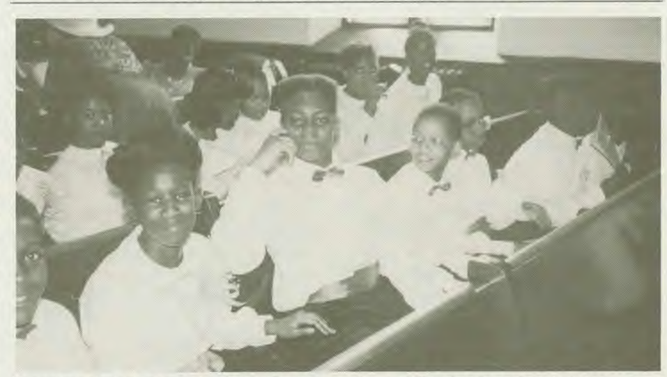
Upperclass students dressed in choir uniforms patiently await their turn to participate in the program

social issues for the betterment of the youth and community.