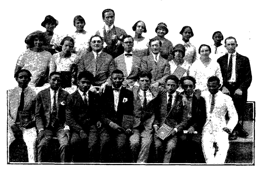
Group of colporteurs attending the Institute held in Bahía mission at end of 1926

"To ALL who are reaching out to feel the guiding hand of God, the moment of greatest discouragement is the time when divine help is nearest."