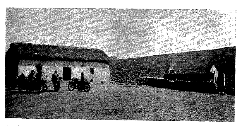
Patalaca is one of the Lake Titicaca Mission schools. An old abandoned Catholic church is seen at the right of the picture.

Another experiment in connection with this meeting was the book stand and the sale of books. We had been told that it couldn't be done, that the Indians would not buy books, but the book stand was