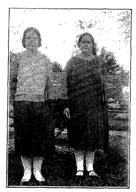
Two successful "Atalaia" colporteurs.

Considering conditions as a whole, this is a splendid record for lady colporteurs, and shows what can be done with our magazine. Strong propaganda was made against their activities by both the Protestants and Catholics, but instead of weakening their efforts, they were strengthened. Two other ladies recently joined them and are doing well in their work. Even though the city is not large, I feel sure they will place 500 combinations, besides many single subscriptions, in this place. They are so filled with the good things this magazine contains that all they can talk about is O Atalaia, and they are setting the city on fire with the message. Nor is this all. They have brought new life into the small Sabbath school at the place where they are working, by taking an active part in it. There are four new