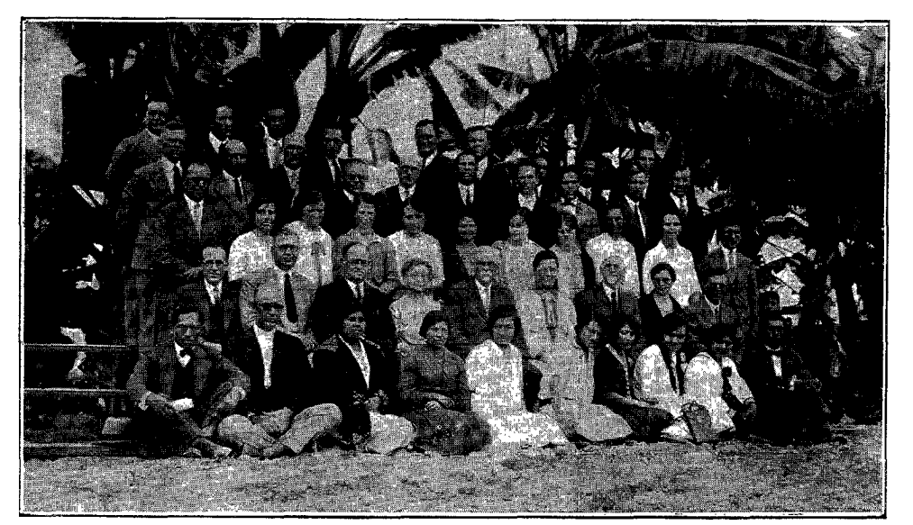
Ministerial Institute held in Lima, Perú.

I think we put the emphasis in the wrong place when we study hard to preach exactly and study little to live exactly. There are those who study a whole week in order to speak well one hour. Yet with some of us it seems too much to study an hour to be able to live rightly a whole week. We study much to preach exactly, but are quite careless about living exactly. Some are very careful not to misplace a word in their sermons or be guilty of any mistake at all in their terminology. I think that is right, for it is a matter that is both holy and important to preach rightly. But let us be just as careful not to misplace our