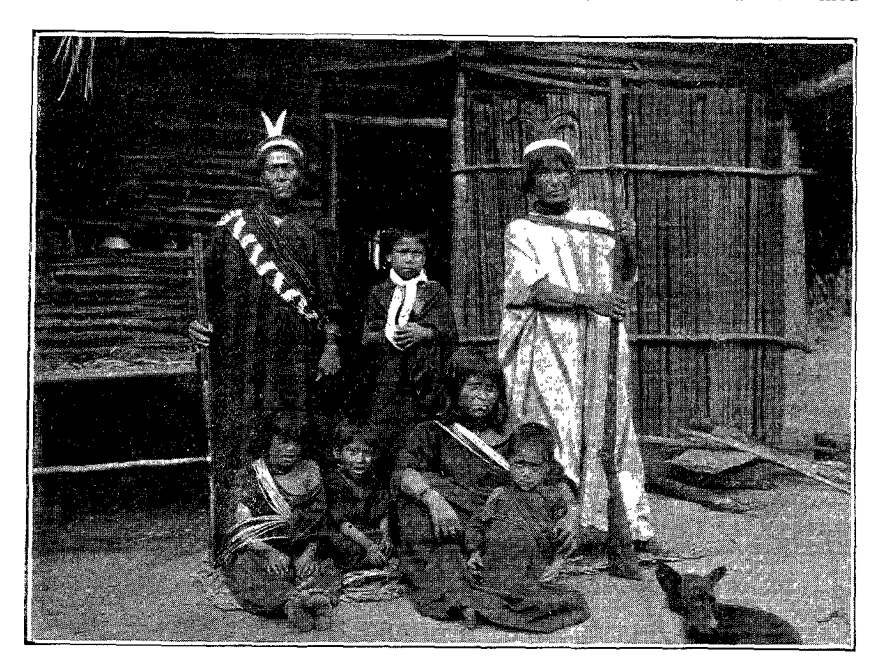
Neighboring Indians of the Campa tribe.

The tribe of Campa Indians is still buried in deepest heathenism and ranks very low in the matter of culture. The first impression received by one who visits these people, is not at all flattering, their hair hangs down in streamers to the shoulders, the eyes have a shifting, restless look. Face and arms are tattooed and decorated with red. As a covering they wear a sort of sack called Kushma which they weave from cotton. The head is covered with a crown made out of bamboo and trimmed