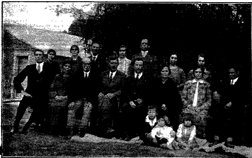
Group of believers in Cural Alto, Rio Grande do Sul, baptized in 1930. Won to the truth through the literature ministry. Three of the same group have entered the colporteur work.

that one can only sense in scattering the seed of truth and seeing the fruit that comes as a recompense for these humble efforts.