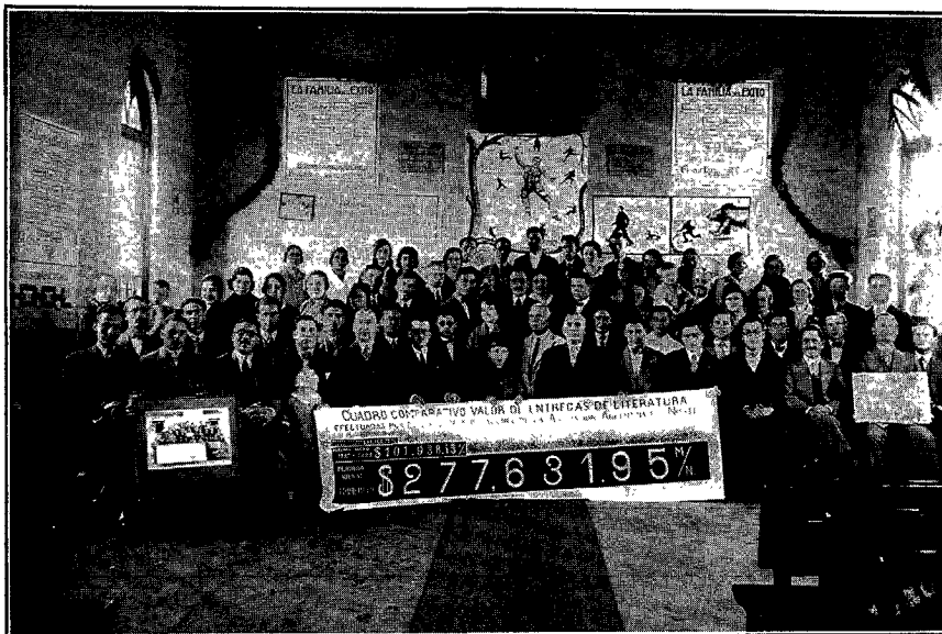
Central Argentine colporteur institute held in Puiggari, Entre Ríos, October 1930.

SEVEN years ago I surrendered my life to the Lord for service in the ministry of the printed page, and during all this time I have experienced the joy