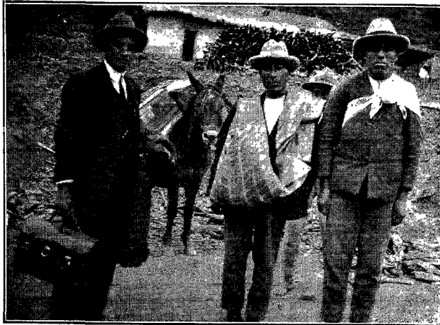
Bolivia's field missionary secretary out on the firing line with two of his Indian colporteurs.