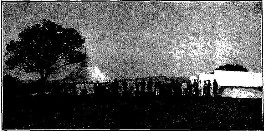
Gideon's Camp. Rio Grande do Sul colporteur institute, held in Taquara in November.

As we consider the past year we cannot refrain from mentioning our church schools and the way God has blessed them. May He daily give courage to this group of workers. The men and women who for a small remuneration are toiling day after day, are laying the foundation for Christian lives. These workers are among the most important, yet many times receive but little credit. They need our prayers, our sympathy, and our hearty support. In these days