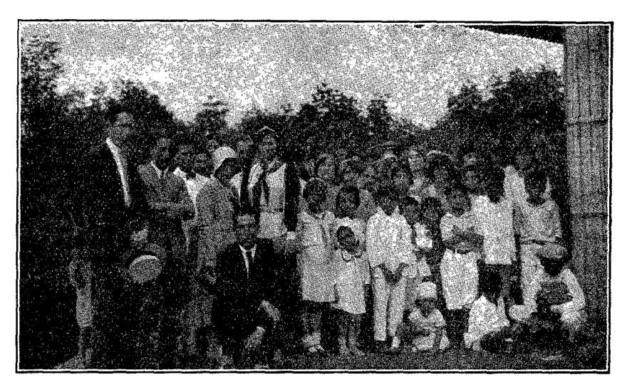
Group of members and recently-baptized believers in Guayaquil, Ecuador.

Christ, the colporteurs of the Central Argentine Conference, by