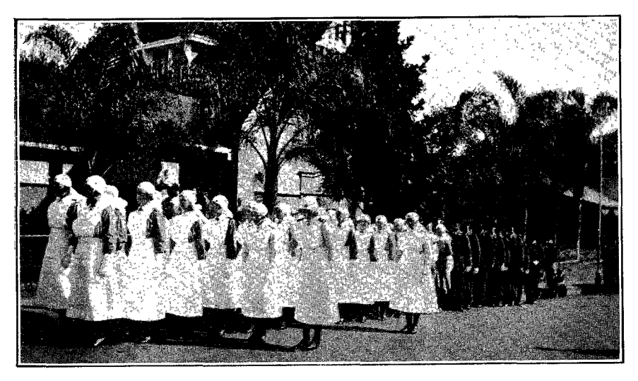
AMBULANCE PARADE LEAVING S. D. A. CHURCH, MARITZBURG

Again I say, heartest congratulations, together with a sincere expression of appreciation of the service you have so nobly rendered. To the Lord be all the praise and thanksgiving for a task so faithfully performed.