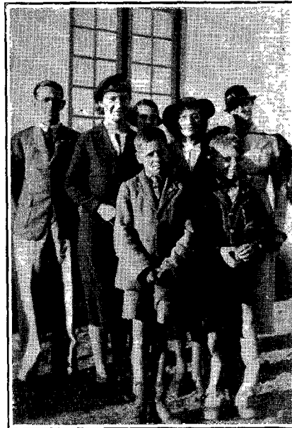
Group of Missionary Volunteers at Kimberley.

"THROUGH wisdom is an house builded and by understanding it is established. And by knowledge shall the chambers be