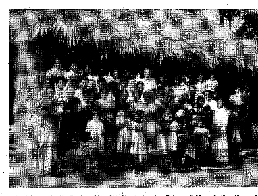
A picture of our Pothureddipalli church in the Telugu field and the 40 newl baptized members and their children.

The contribution of our staff members and students toward the attainment of these objectives during the training period has already been blessed. The problems have been many but God has directed in their solution. Your continued prayers are solicited for this work.