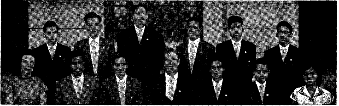
Spicer Memorial College, Class of '58.