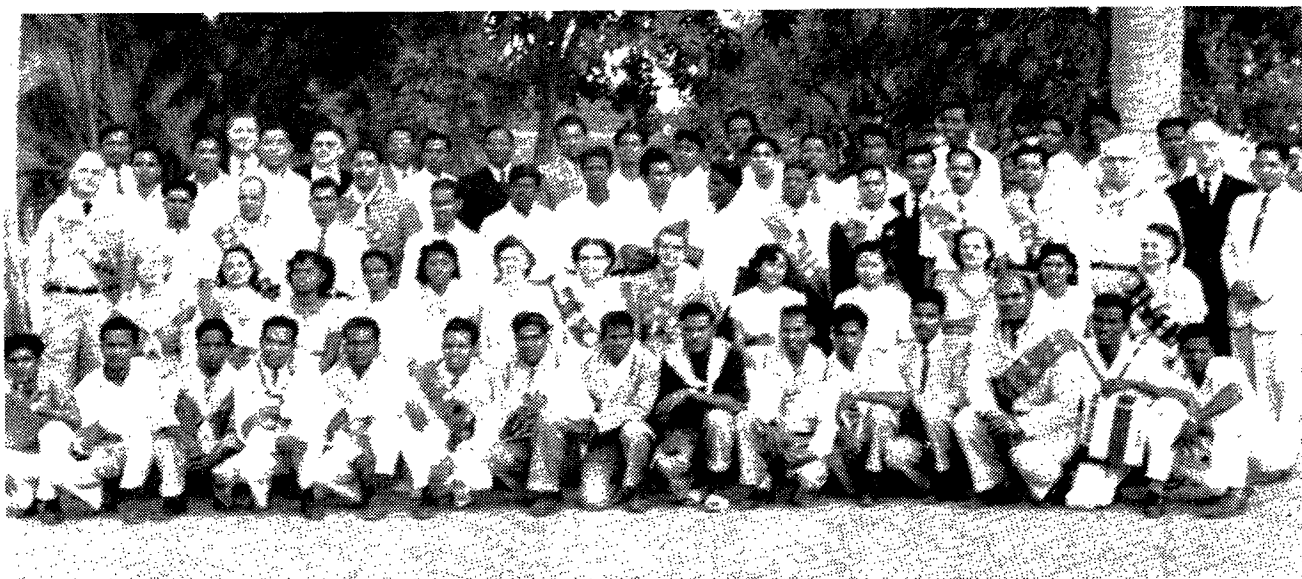
This group of Southern Asia youth leaders are Master Guides.

Prayer Bands, literature bands, branch Sabbath schools, Voice of Youth efforts in which our young people actually do the speaking, the singing and all the rest—these are part and parcel of the MV Week. Has someone had a part in bringing spiritual help into your life? "Go thou, and do likewise."