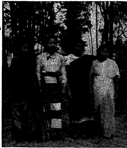
These girls represent four of the language groups at A. T. S.: Khasi, Lushai, Naga, Garo.

At six o' clock, Friday morning, we again find the girls in the workshop room ready to repeat the morning watch text. "Let us remember that this is Friday and the preparation day. Don't forget to be ready for the Sabbath," is the reminder given as the girls disperse. It has been a busy day of study, classes, work and preparation, but shortly before sundown, all gather again to sing choruses. This evening all repeat the fourth commandment. Seven-thirty brings vespers. After this, some stay for