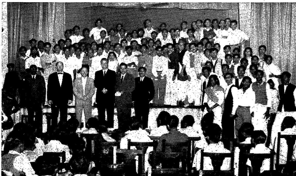
Voice of Prophecy graduates attending the rally in Calcutta.