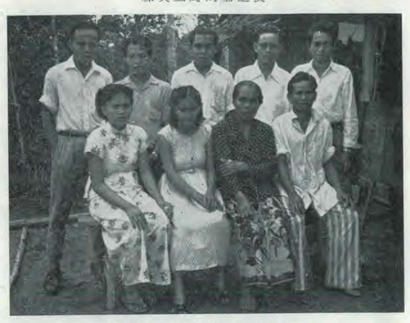
Baptismal candidates at Siniawan

lecture had to be cancelled because of the the Merdeka night celebration when people were anxious to see all the bright lights, arches and places of interest in the city of Penang.