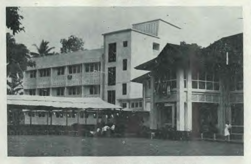
Penang Sanitarium and Hospital, Penang, Malaya

Hospital, has seen the arrival and departure of its overseas personnel with regular monotony since its establishment in the 1920's, yet it is doubtful if any year, including even the time of the Japanese occupation, has been marked by such comings and goings amongst our medical and administrative staff as has 1957. We have had two Directors of Nursing, two Business Managers and no fewer than seven different doctors all serving for varying periods over the last twelve months. It says much for the confidence of the Public in our medical work that the patronage has maintained as well it has despite such fluctuations, because the unwillingness of patients to change their medical adviser is too well-recognized to need emphasis.