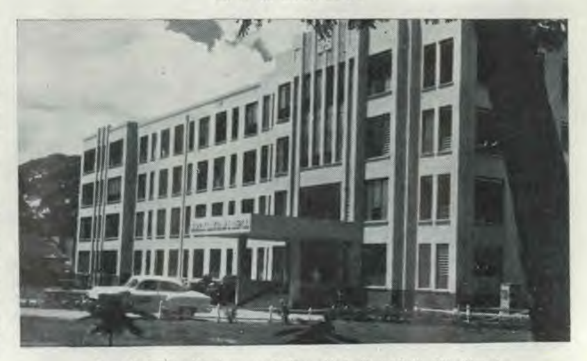
Bangkok Sanitarium and Hospital, Bangkok, Thailand