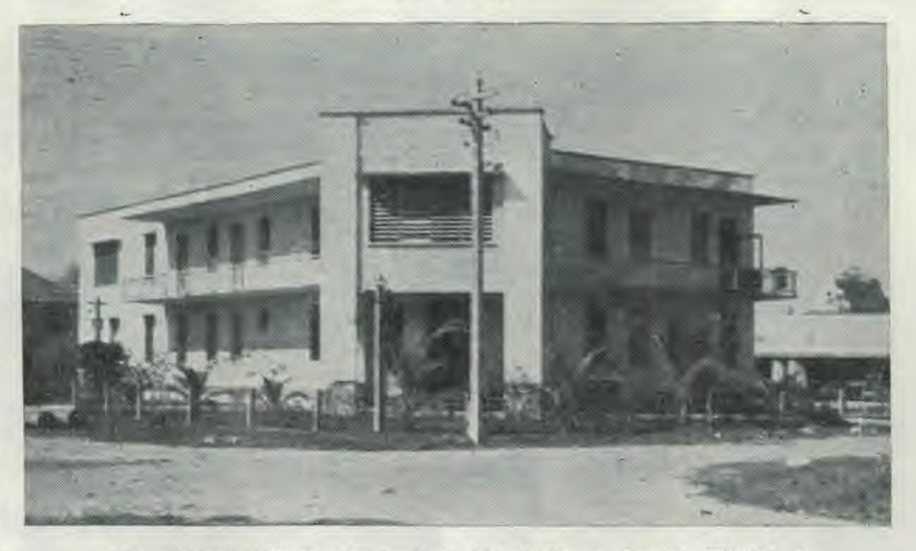
Haad Yaai Mission Hospital, Haad Yaci, South Thailand

for 300,000 ticals over the past two years. Also the mission has erected a local pastor's home on a small corner of this compound. With added buildings has come more landscaping and other improvements.