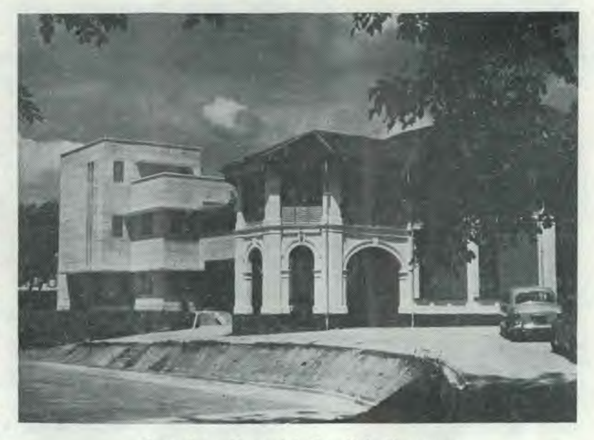
Youngberg Memorial Hospital, Singapore

baptized. They learned the truth as a result of visiting their grandfather while he was in the hospital. Their hearts are won to God, but their parents are staunch Buddhists and sternly forbid them the privilege cf joining the church.