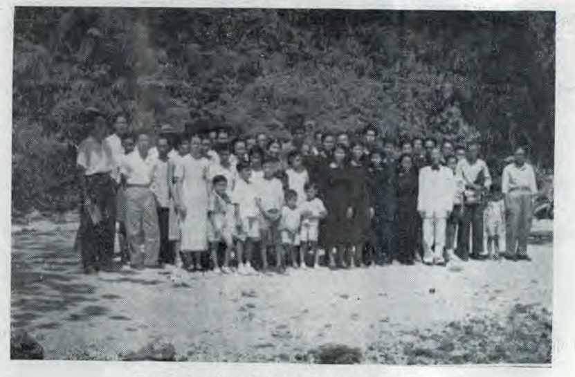
Kudat baptismal scene December, 1957.