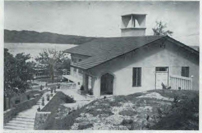
The beautiful new Jesselton church stands like a beacon of light overlooking the city below and the sea beyond.

All these schools, except one, are aided financially by the Sarawak government.